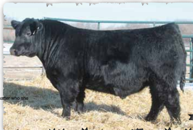
PEAK DOT SEEDSTOCK 122E - LOT 94

>His gorgeous dam has been a very consistent embryo producer resulting in high caliber progeny no matter who she has been mated to. She is one of the most influential cows at Peak Dot with 45 progeny to date.