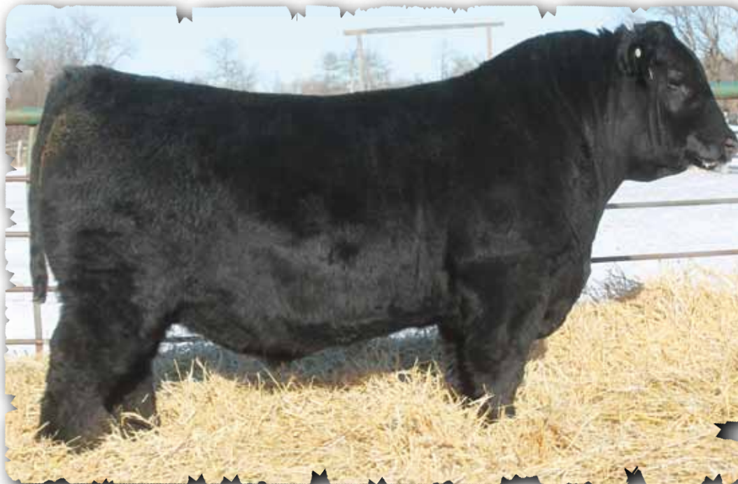
PEAK DOT UNANIMOUS 170E - LOT 61