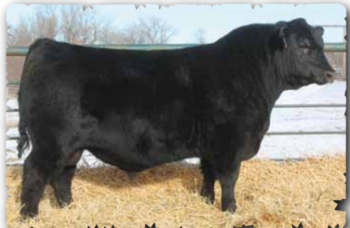
PEAK DOT TOPSOIL 17E - LOT 118

>Radiance dam has well attached udder with small teat size.