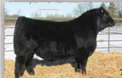
PEAK DOT TOUR OF DUTY 27C The maternal brother to lot 61

Corey and Jackie Dumelie purchased a maternal brother to lot 61 in the Spring 2016 Bull Sale.