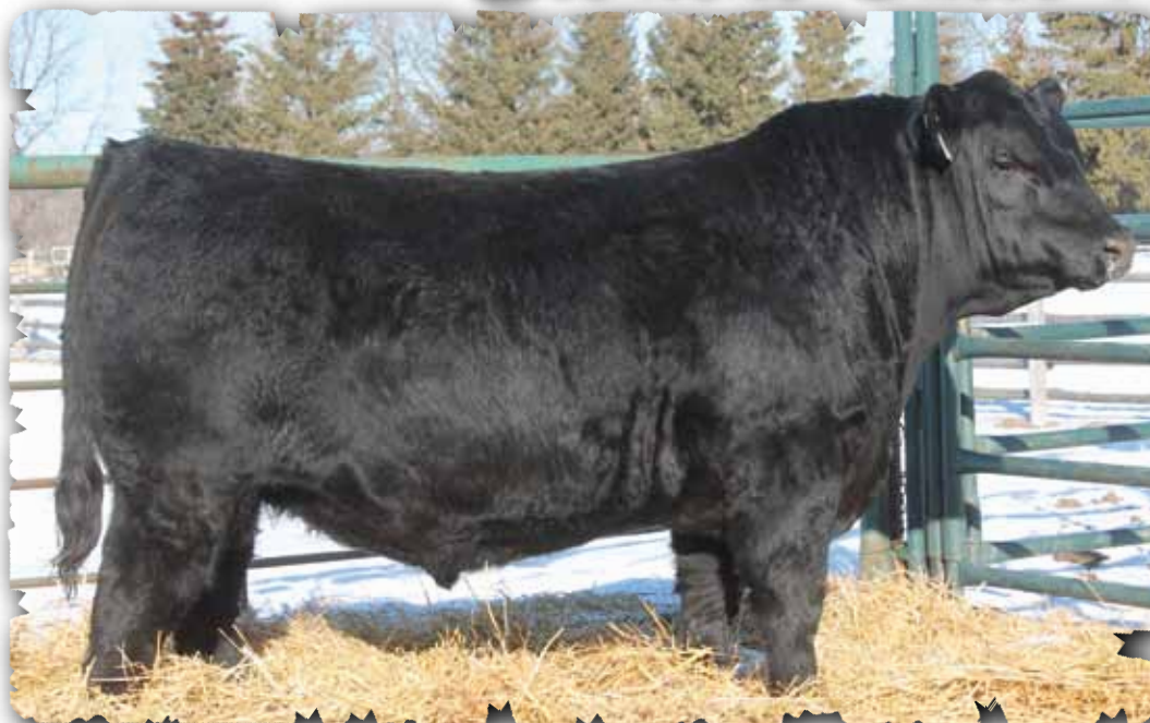
PEAK DOT ELEMENT 381E - LOT 9

Kent Alleman from Alleman Angus Ranch Idaho purchased a full brother to lot 9 in the 2017 spring sale.