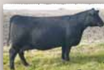
SAV ELBA 801 The dam of Radiance

SAV Radiance 0801 was the high selling SAV Brilliance 8077 son from the record breaking 2012 SAV Sale to Peak Dot Ranch. SAV Radiance has excelled at nearly every measure. He combines a herd improving EPD profile and impeccable pedigree with powerful phenotype - massive and deep with tons of muscle. His perfect uddered dam by Net Worth is a daughter of the # 1 milk EPD and high-income-producing cow in SAV history. Radiance has proven himself as a calving-ease sire and his sons come highly recommend for heifers.