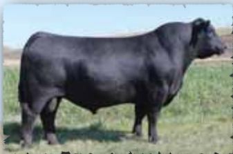
Bush Easy Decision 98