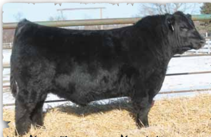
PEAK DOT ELEMENT 293E - LOT 14

>Eliminator 723A dam has an excellent udder and one of the best EPD numbered cows in the herd.