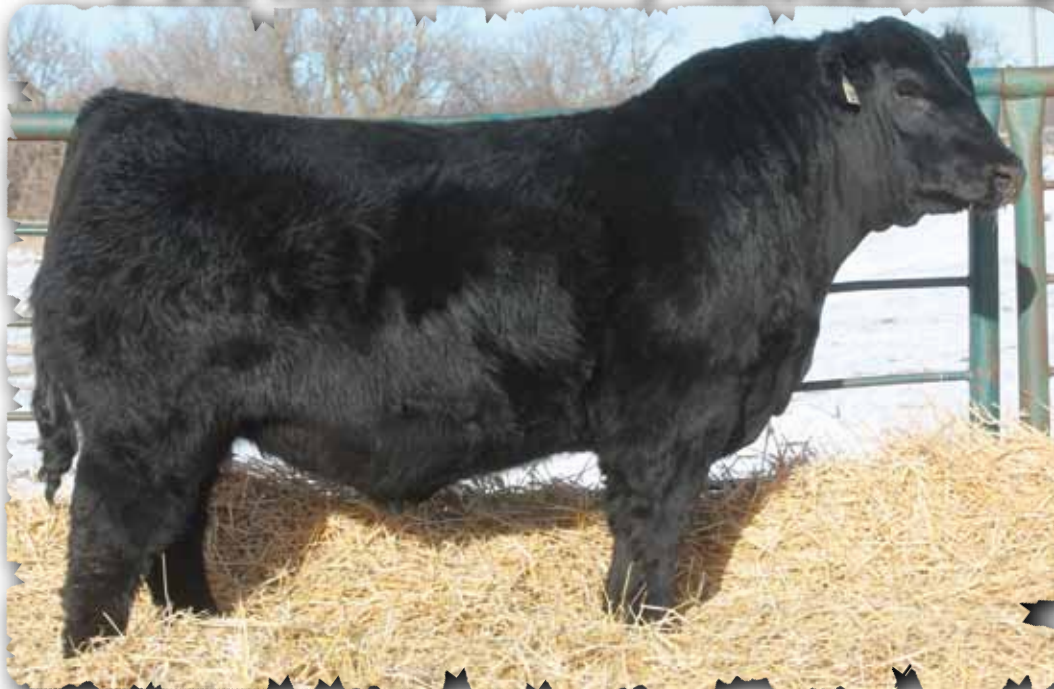
PEAK DOT ATTRACTIVE 93E - LOT 146

Craig Spady purchased a maternal brother to lot 148 in the 2017 spring sale.