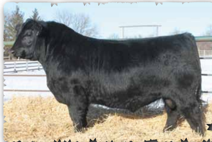
PEAK DOT UNANIMOUS 229E - LOT 65

>Dam along with her full sister and mother are embryo donors.