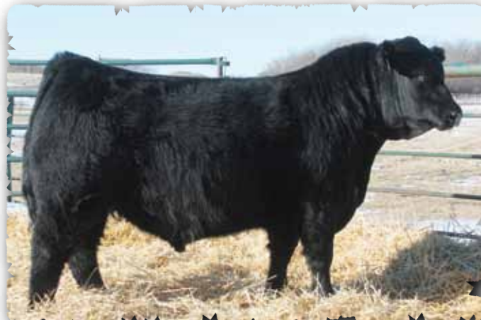
PEAK DOT PRIME 333E - LOT 82

>Dam is moderate, deep bodied and nice fronted