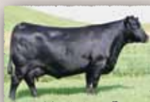
SAV ELBA 1094 The maternal grandam of Radiance