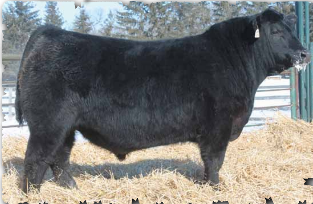
PEAK DOT EASY DECISION 2099E - LOT 157