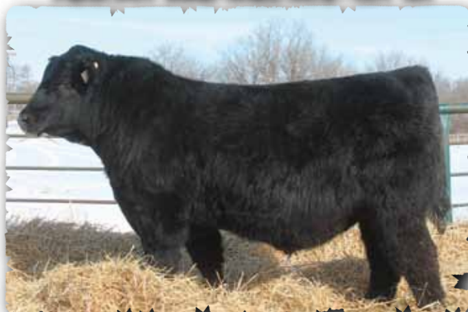
PEAK DOT WIND CHILL 442E - LOT 152