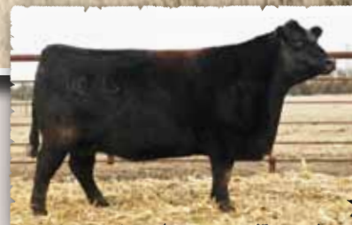
4M BLACKBIRD 2004 The dam 4M Element 405

Element was the lot 1 top selling bull we purchased from 4M Angus in Blue Hill Nebraska. We later sold an interest to Semex Beef where he became a leading member of their sire roster.