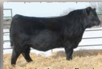
PEAK DOT OUTCOME 5D Purchased by Alta Genetics .