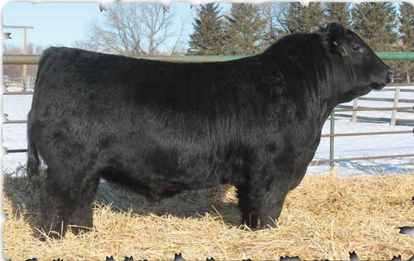
PEAK DOT FOOTHILLS 109E - LOT 75