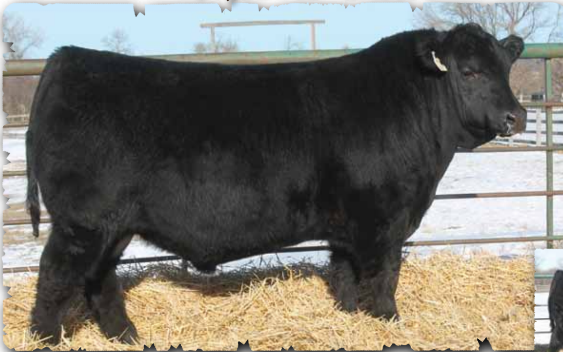
PEAK DOT TOPSOIL 176E - LOT 116