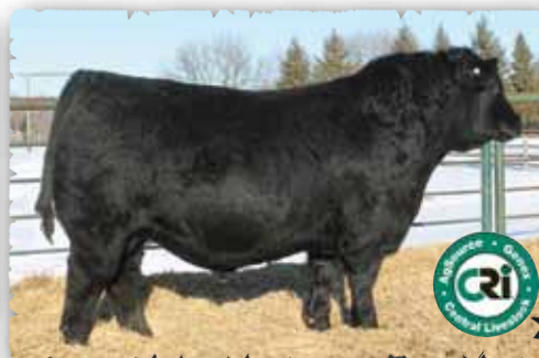
PEAK DOT FOOTHILLS 1012B Contact Genex for semen