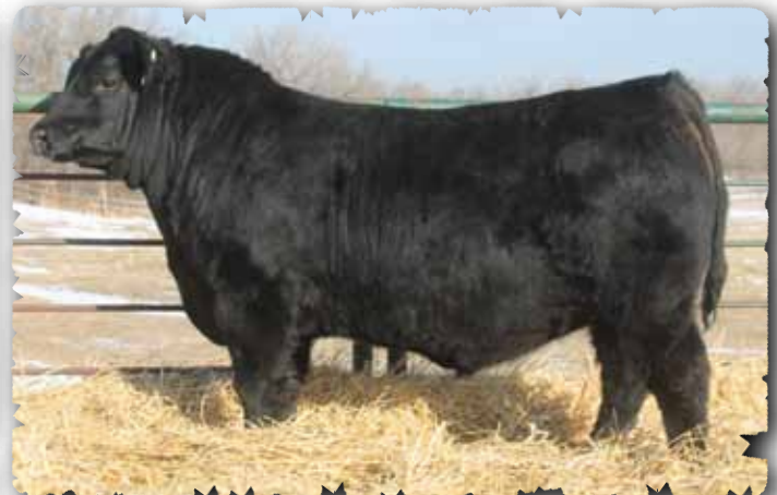
PEAK DOT NO DOUBT 287E - LOT 38