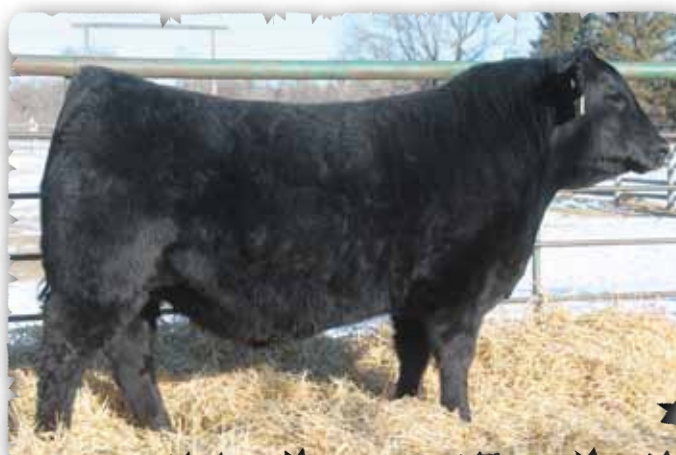
PEAK DOT TOPSOIL 2070E - LOT 121