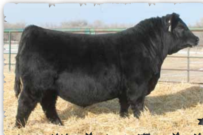
PEAK DOT NO DOUBT 2102E - LOT 45

>Three generations of donors. Heavy milking Eliminator daughter has extra body depth.