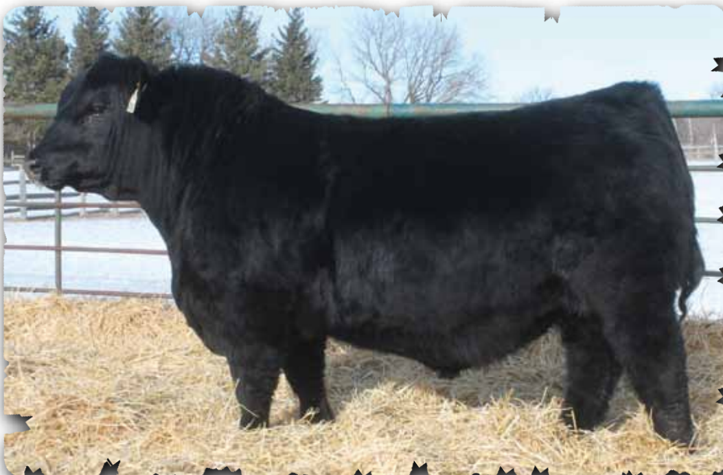
PEAK DOT NO DOUBT 103E - LOT 43