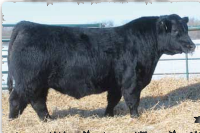
PEAK DOT LIBERTY 242E - LOT 178