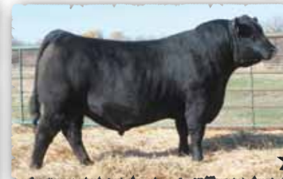
PEAK DOT NO DOUBT 81D

This maternal brother to lot96 was the lot 1 top selling No Doubt son from the fall 2017 sale.