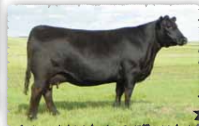
ERICA OF PEAK DOT 478U The dam of lot 58-59 and 60