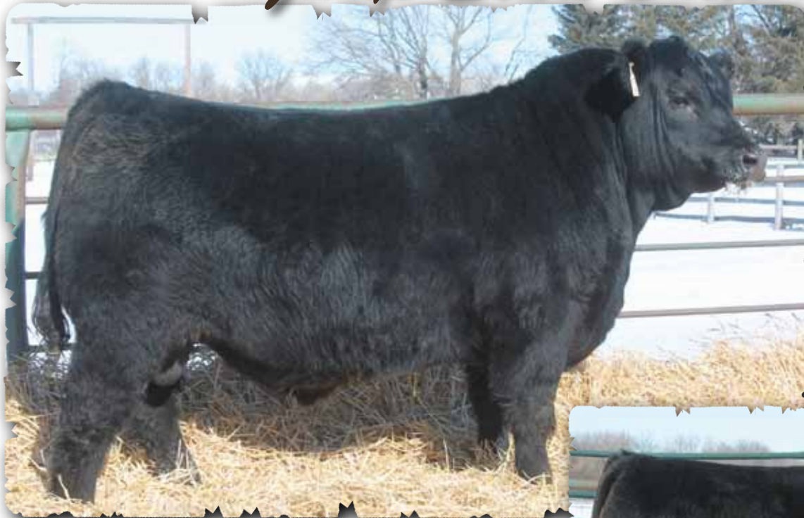
PEAK DOT JUMP START 238E - LOT 172