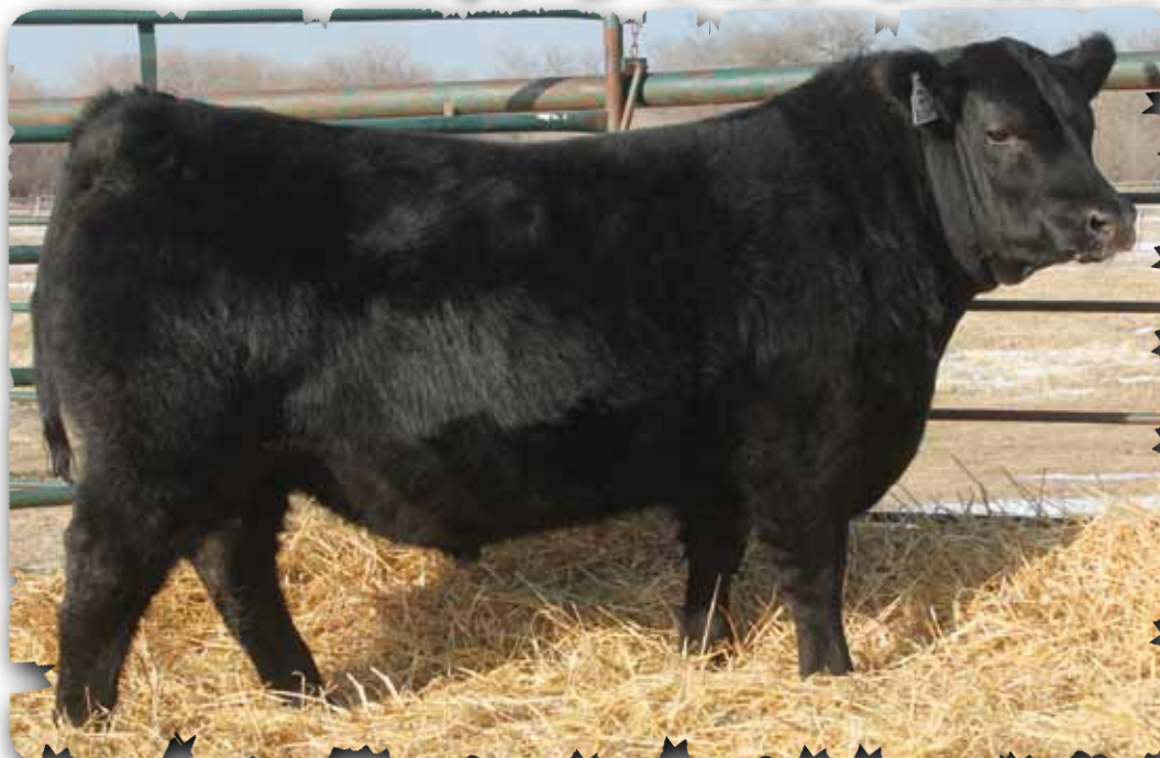
PEAK DOT NO DOUBT 902E - LOT 44