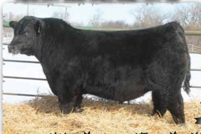
PEAK DOT WIND CHILL 447E - LOT 151