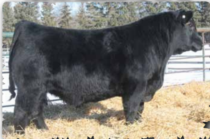
PEAK DOT HERDBOOK 2150E - LOT 185