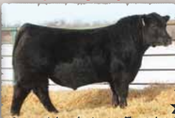
PEAK DOT EASY MONEY 34D Purchased by Northway Cattle co..