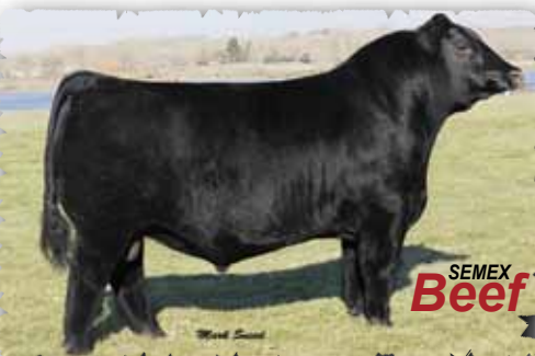
PEAK DOT MOUNTAIN TOP 940X Contact Semex for semen