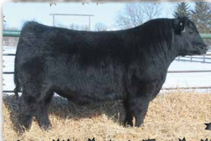
PEAK DOT EASY DECISION 296E - LOT 169