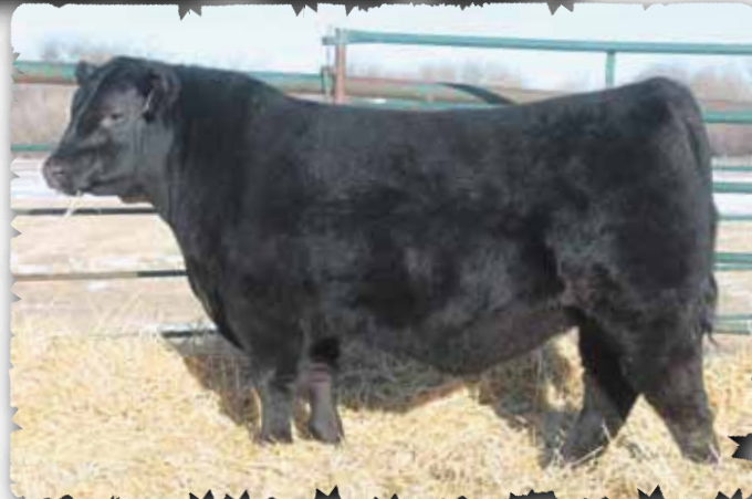
PEAK DOT HONOR 370E - LOT 104

>Beautiful dam is backed by two generations of donor cows.