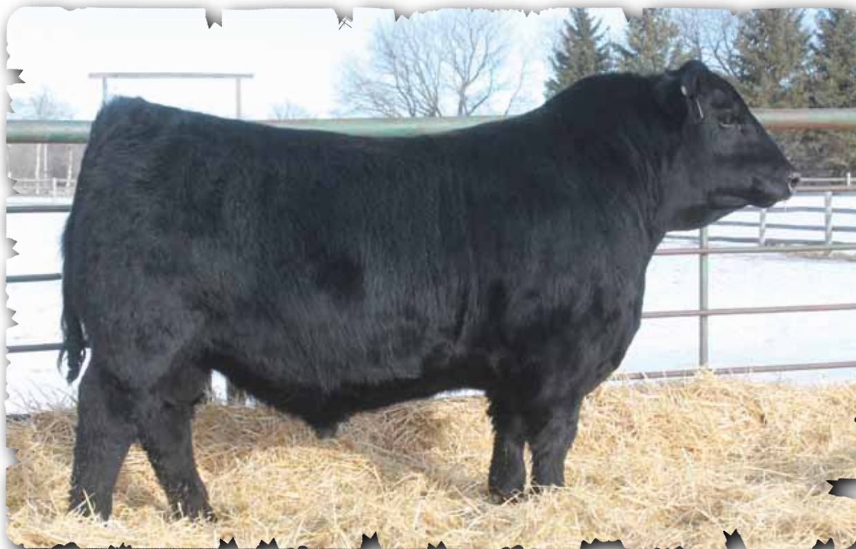
PEAK DOT SEEDSTOCK 34E - LOT 92

SAV Seedstock 4838 is the $235,000 lead off bull from the 2015 SAV sale. He posted a 205 day weight of 1025lbs and scanned a 365-day REA of 17.1 inches. His pedigree uniquely blends the all-time greatest maternal icons, SAV May 4136 and SAV Madame pride 0075. SAV Seedstock is a maternal brother to SAV Honor and SAV Renown.