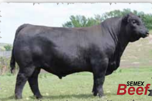
PEAK DOT GLADIATOR 800Y Contact Semex for semen