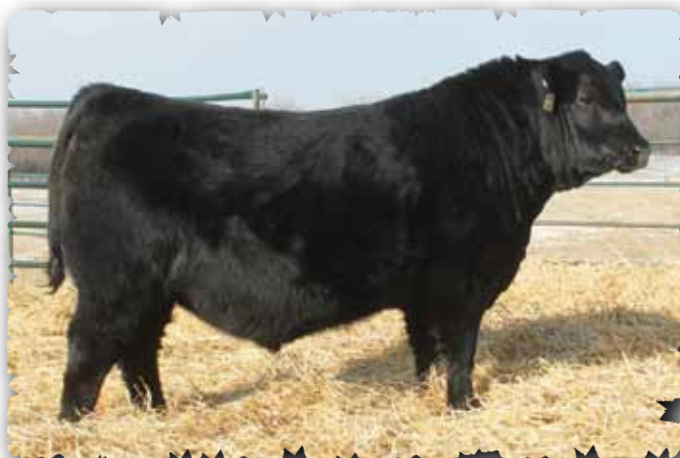
PEAK DOT NO DOUBT 2149E - LOT 49