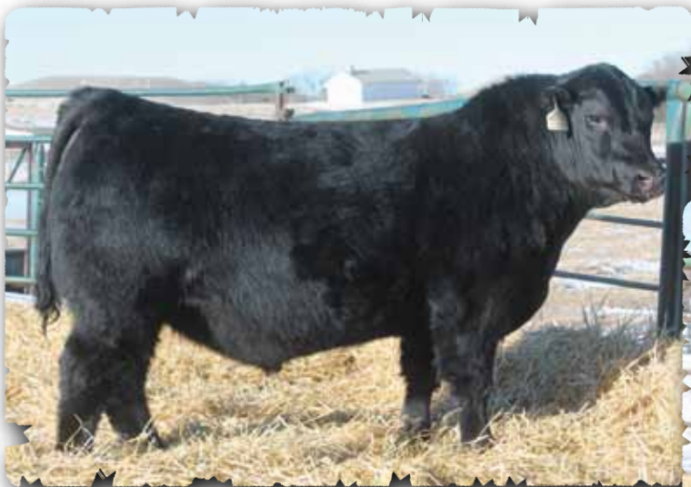
PEAK DOT ELEMENT 2003E - LOT 31