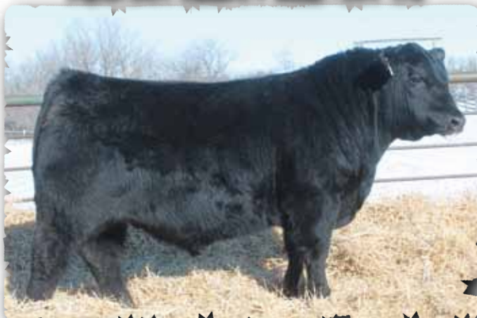
PEAK DOT LIBERTY 327E - LOT 180