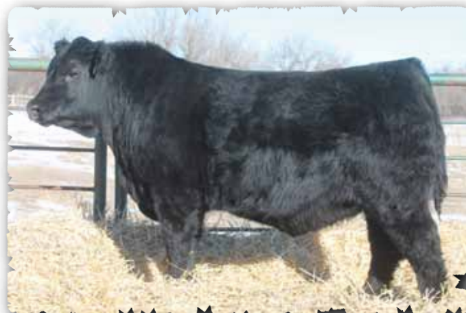
PEAK DOT FOOTHILLS 197E - LOT 78

>Recommended for heifers or cows >Moderate framed and thick. Gentle. >Grandam is a past embryo donor..