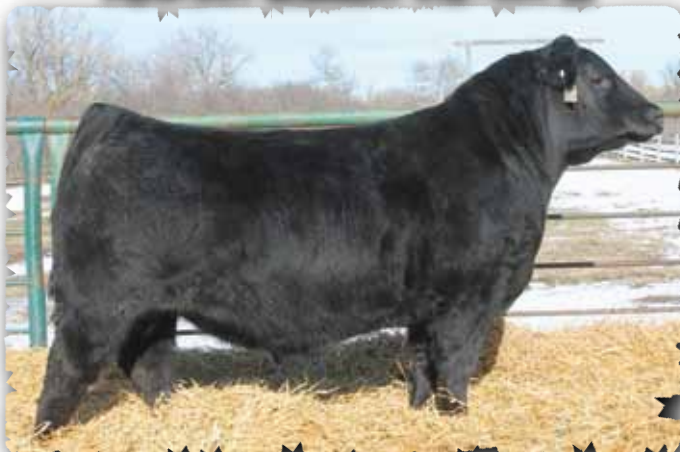
PEAK DOT ELEMENT 256E - LOT 23