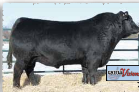
PEAK DOT BOLD 204U Contact Cattle Visions or Peak Dot for semen