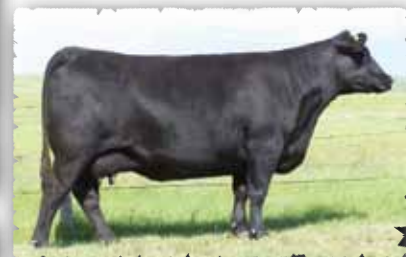
LADY OF PEAK DOT 402U

This maternal brother to lot96 was the lot 1 top selling No Doubt son from the fall 2017 sale.