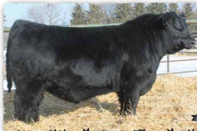
PEAK DOT NO DOUBT 466E - LOT 41

>Dam is a powerful made Encore daughter.