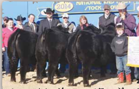
2014 Natl Western Stock Show Reserve Champion Pen Cash Flow pictured on the right was the lead bull in the 2014 National Western Stock Show Reserve Champion Pen of bulls