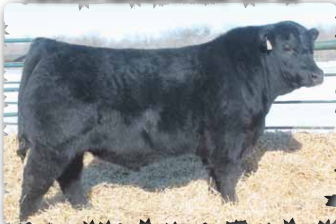
PEAK DOT HERDBOOK 330E - LOT 183