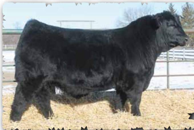
PEAK DOT EARNHARDT 471E - LOT 130

>Dam is a moderate framed Bullet daughter.