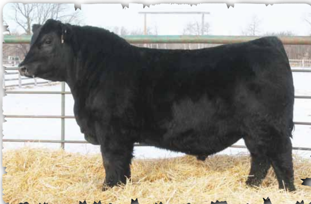
PEAK DOT SEEDSTOCK 315E - LOT 93