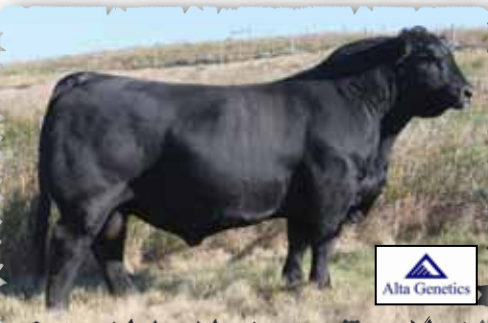
PEAK DOT PRIME 733B Contact Alta Genetics for semen