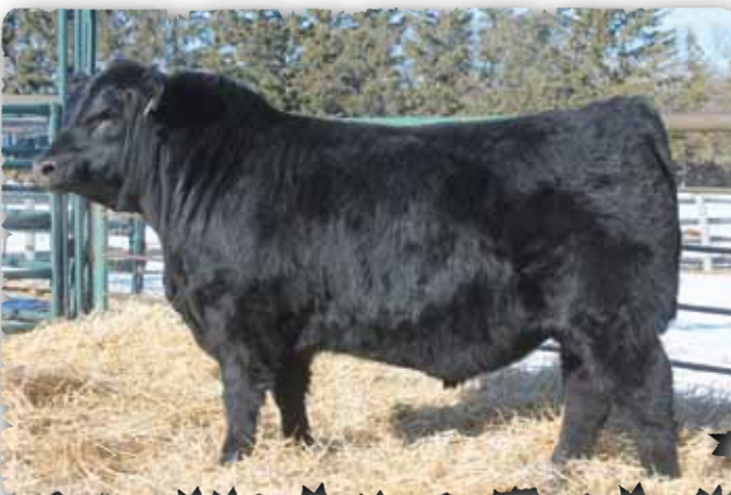
PEAK DOT UNANIMOUS 361E - LOT 66