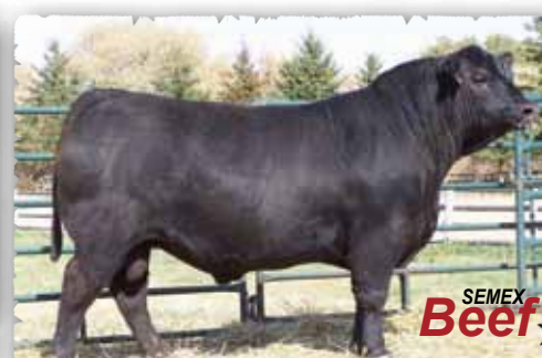
PEAK DOT IRON MOUNTAIN 654X Contact Semex for semen