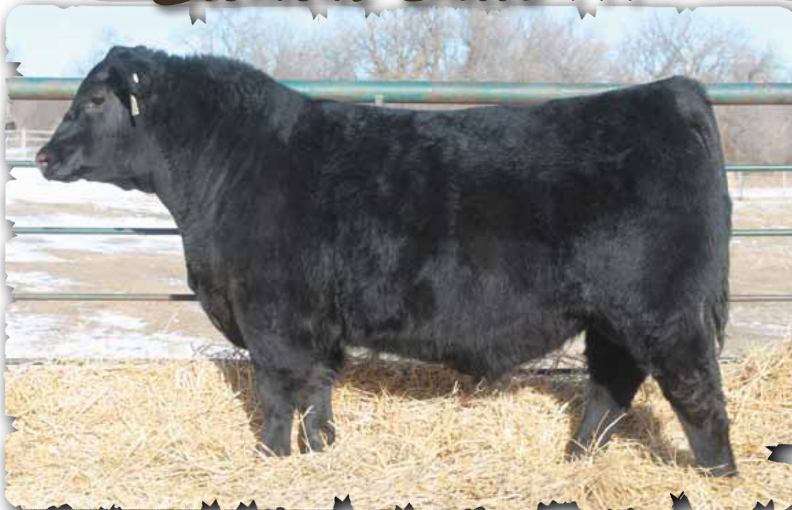
PEAK DOT ELEMENT 2015E - LOT 24