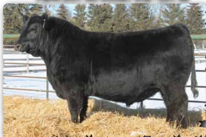
PEAK DOT NO DOUBT 249E - LOT 57