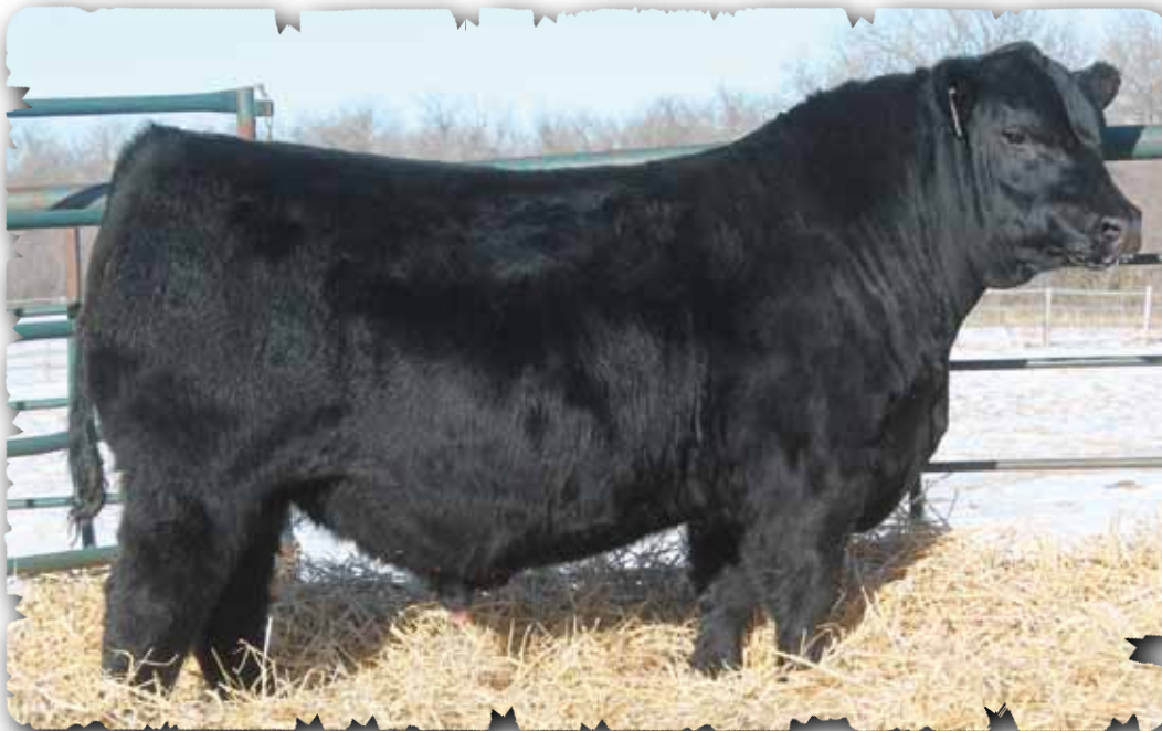
PEAK DOT ELEMENT 65E - LOT 7