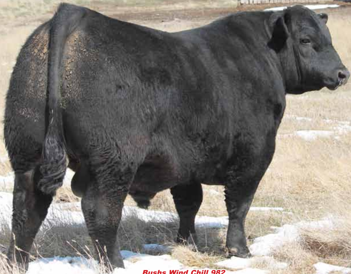
Bush Wind Chill 982