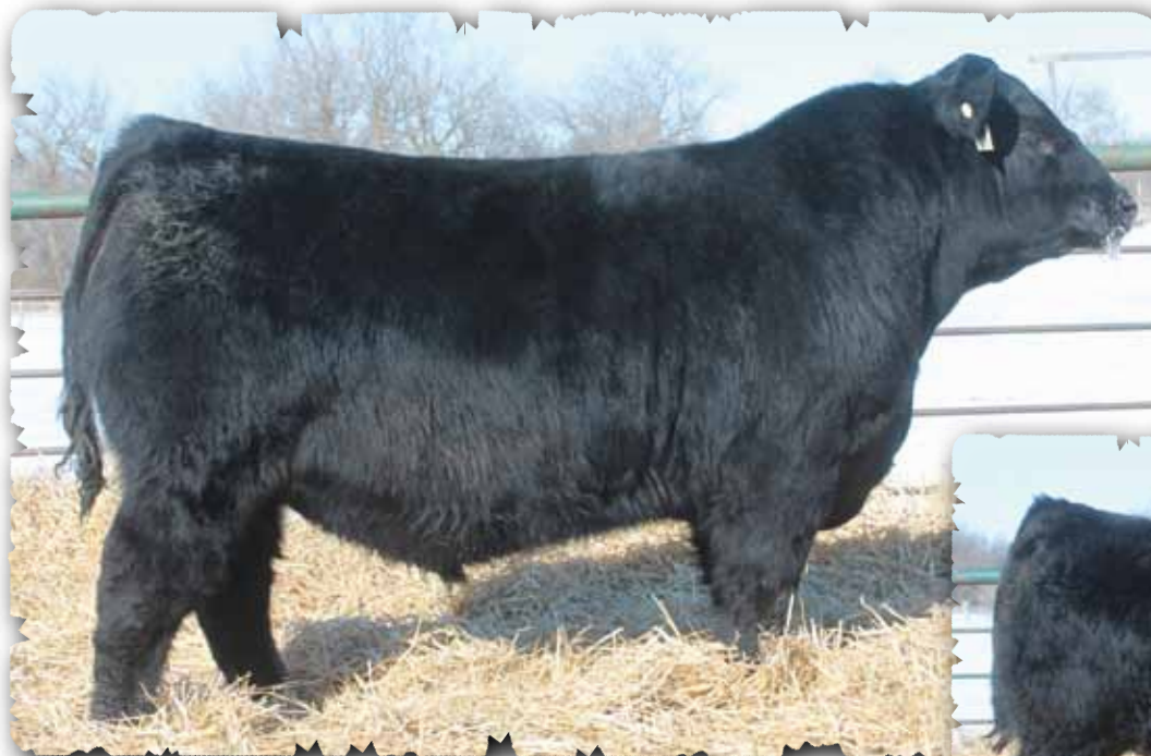
PEAK DOT EASY DECISION 306E - LOT 164

The lead off bull in the power flush from Mia of Peak Dot 40Y in the 2016 Peak Dot spring sale selling to Hillcrest Enterprises. Peak Dot Easy Decision 952C offers sons that are consistently thick deep bodied bulls. They are very similar in type and kind.