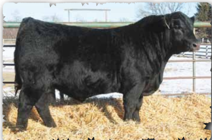
PEAK DOT RADIANCE 88E - LOT 109

>Dam was the top pick of her heifer calf crop.