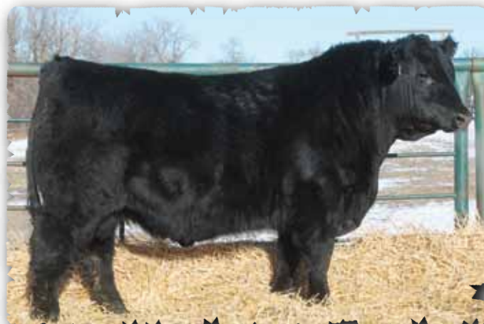
PEAK DOT PRIME 297E - LOT 83

>Dam has three daughters retained in the herd.