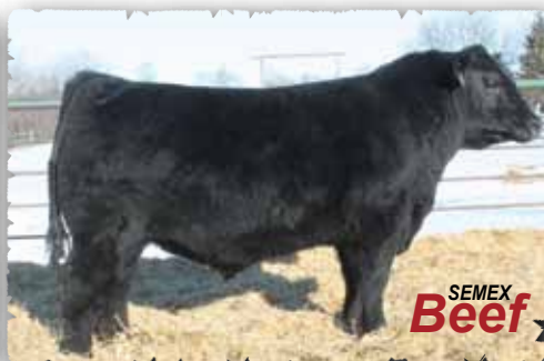
PEAK DOT JUMP START 142C Contact Semex for semen