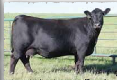
LADY OF PEAK DOT 459U The maternal grandam of lot 161