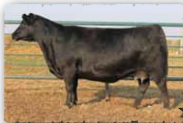
DUCHESS OF PEAK DOT 186T The maternal grandam of lot 113