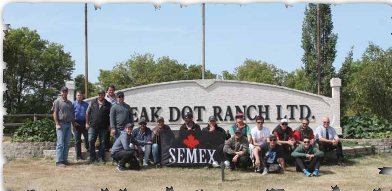
2017 Semex Argentina Tour