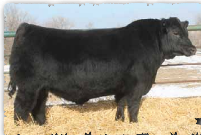
PEAK DOT NO DOUBT 55E - LOT 40

>Three generations of donor cows. Dam has 22 progeny.