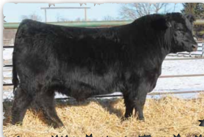
PEAK DOT EARNHARDT 273E - LOT 136

>Dam weans big calves. She is a full bodied daughter of Dold.