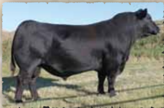
Hoover No Doubt