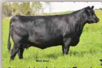
VISION EDELLA 665

We purchased Unanimous as the lot 1 top selling bull in the 2012 Vision Angus Bull sale. Unanimous sons have been well received topping several sales around the country. They are a true testament to him displaying impressive three-dimensional pounds, mass and body on a moderate frame. His sons are solid on their feet, very stout built and gentle to handle while his daughters are extremely feminine and broody. Unanimous has generated much excitement within the Angus breed and will continue to be a major contributor to the future of the beef cattle industry.