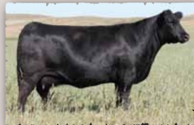
BARDOLIA OF PEAK DOT 639X