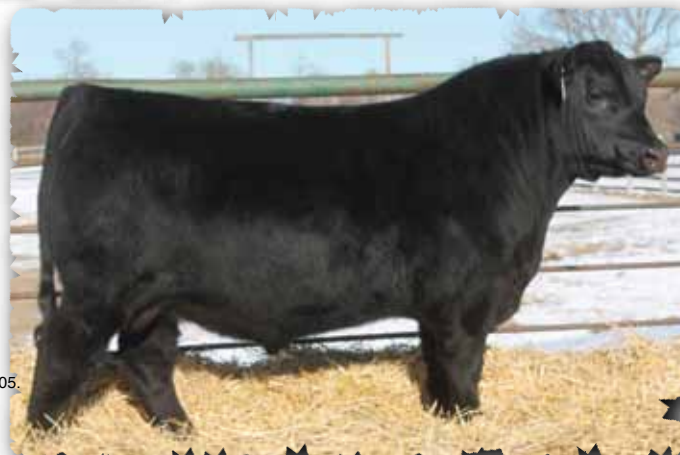
PEAK DOT ELEMENT 76E - LOT 5

>Dam has produced progeny at Northway Cattle, Solberg Livestock and Seven Blackfoot Ranch.