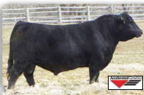
PEAK DOT ENCORE 502W Contact Accelerated Genetics for semen