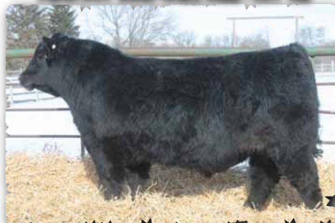
PEAK DOT WIND CHILL 440E - LOT 153