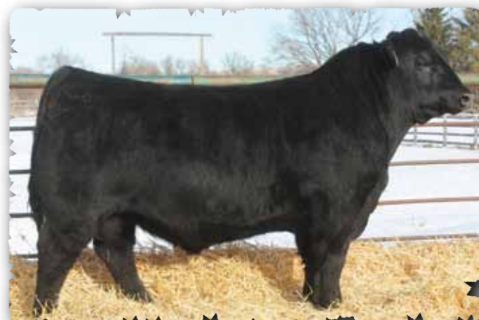
PEAK DOT SEEDSTOCK 45E - LOT 98