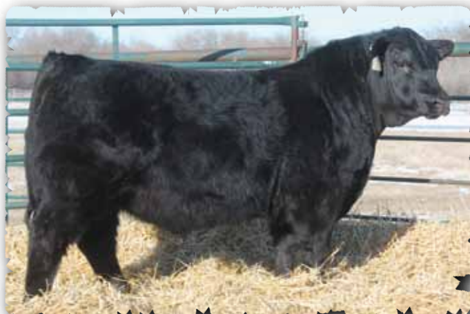
PEAK DOT ELEMENT 2020E - LOT 18