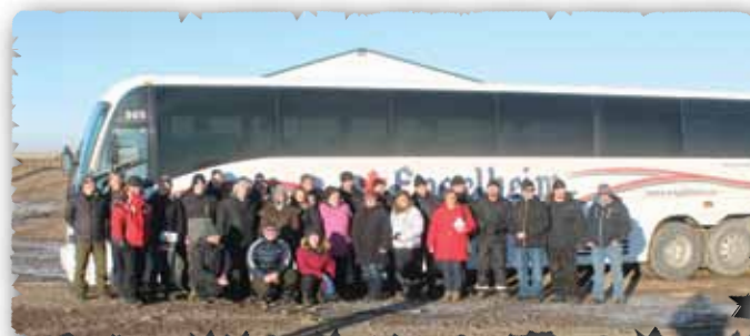
Visitors from Sweden

BW: 84lbs. Adj 205 day Wt: 922 lbs. BW:+4.5 WW:+67 YW:+119 Milk:+20