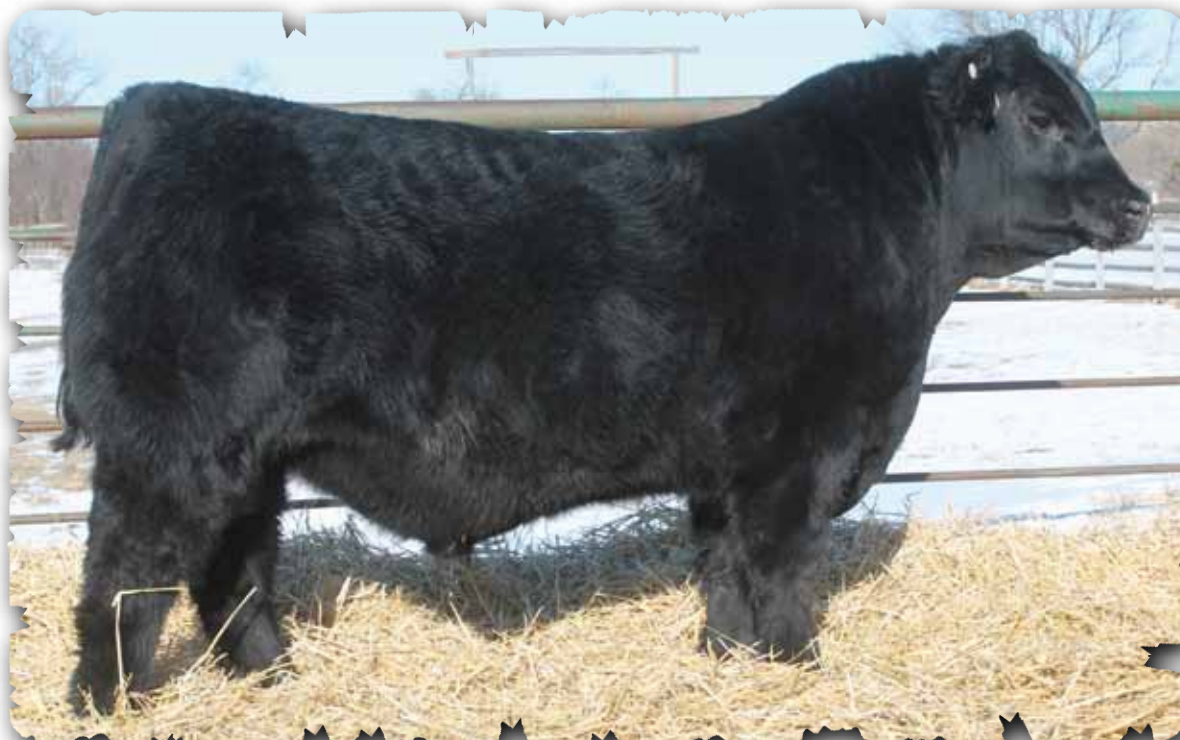
PEAK DOT PRIME 451E - LOT 84