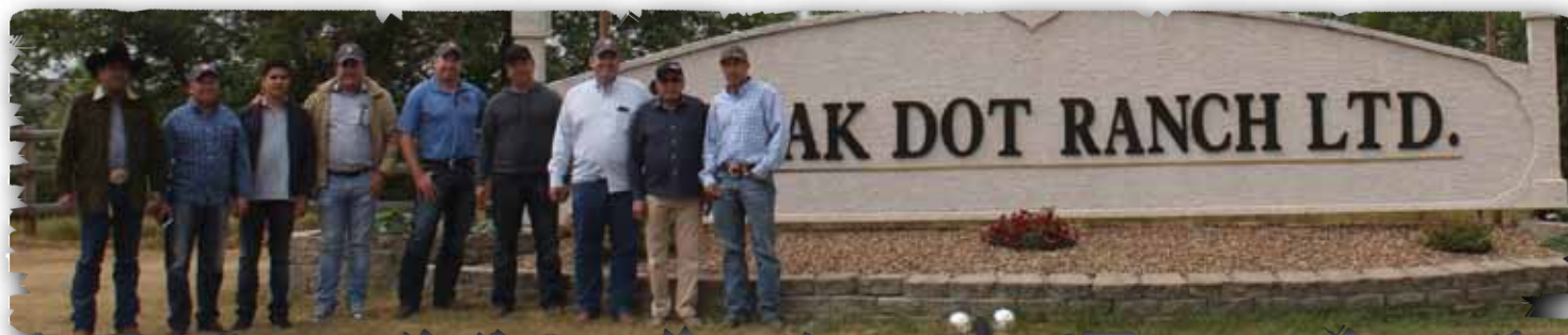
2017 Semex Brazil Tour