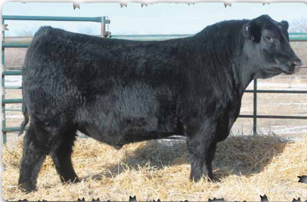
PEAK DOT EARNHARDT 20E - LOT 132