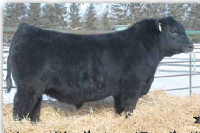
PEAK DOT PHANTOM 334E - LOT 148