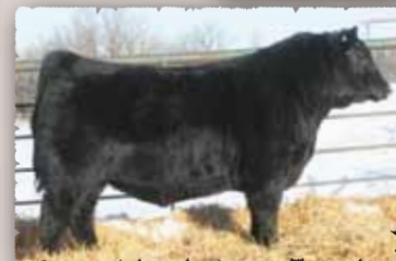
PEAK DOT NO DOUBT 235D The maternal brother to lot 146