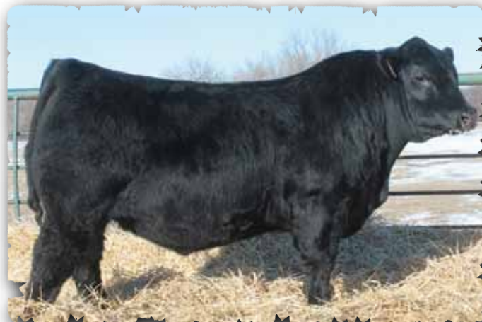
PEAK DOT UNANIMOUS 31E - LOT 59

>Recommended for heifers or cows >Flush brothers from the mating of Unanimous to the world class donor Erica of Peak 478U. >They are strong topped with thickness, muscle, power and performance. >Their gorgeous dam has been a very consistent embryo producer resulting in high caliber progeny no matter who she has been mated to. She is one of the most influential cows at Peak Dot and along with several of her daughters will lead the way as we continue to stack our cowherd with fertility, longevity and maternal value.