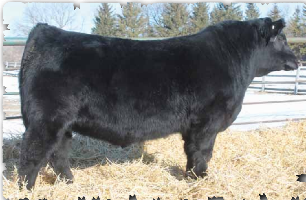
PEAK DOT ELEMENT 2095E - LOT 17