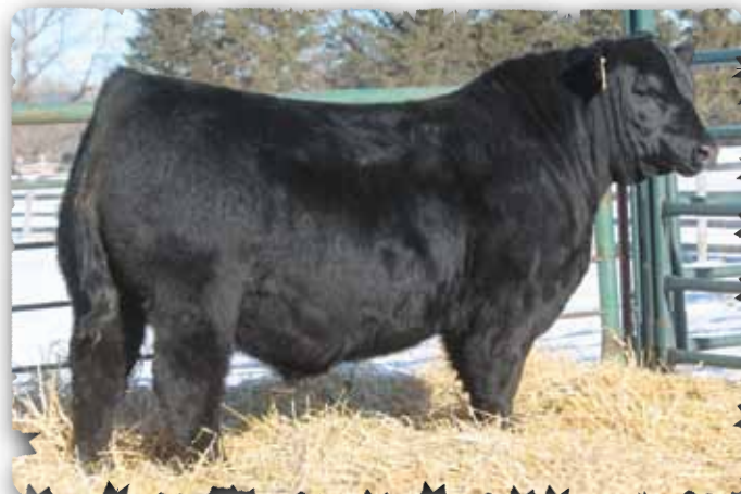
PEAK DOT UNANIMOUS 69E - LOT 60