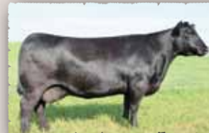
SAV Blackcap May 4136 The dam of Honor

Our pick of the 2015 SAV sale. Honor posted an October actual weaning weight of 1065lbs. Honor is a direct son of the famous SAV Blackcap May 4136. SAV Blackcap 4136 may ranks among the top producing cows at SAV with $1.9 million in progeny sales. SAV Honor is a maternal brother to SAV Seedstock and SAV Renown. SAV Honor is owned with Semex.