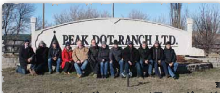
Visitors from Estonia

BW: 77lbs. Adj 205 day Wt: 902 lbs. BW:+2.3 WW: +68 YW: +112 Milk: +18