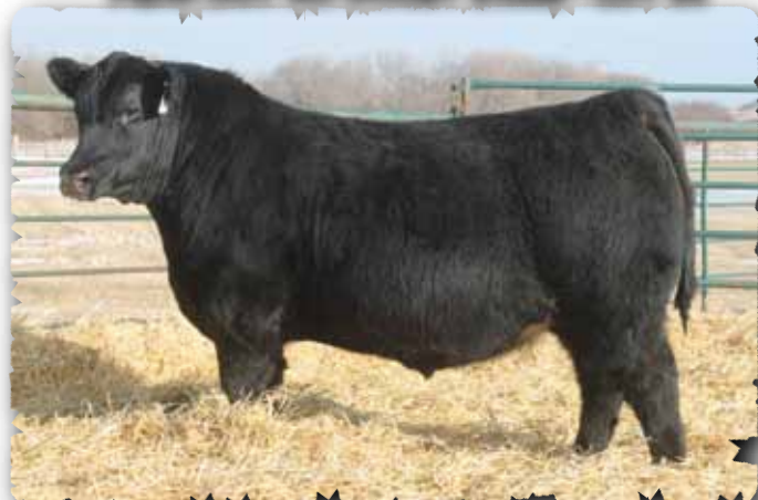
PEAK DOT NO DOUBT 283E - LOT 55