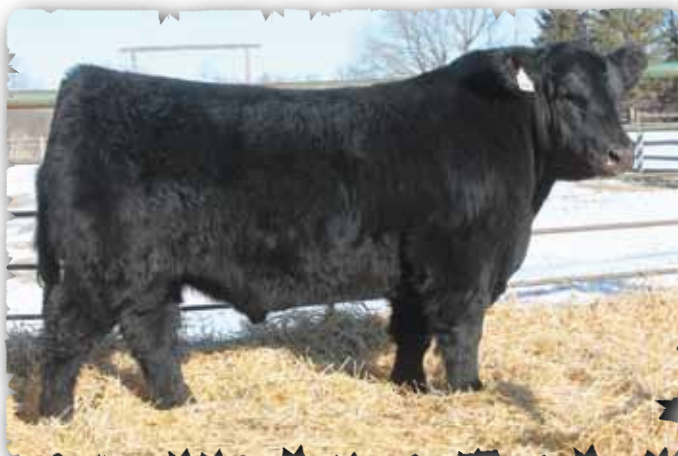
PEAK DOT EARNHARDT 248E - LOT 134