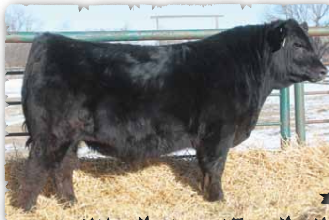
PEAK DOT UNANIMOUS 2430E - LOT 73