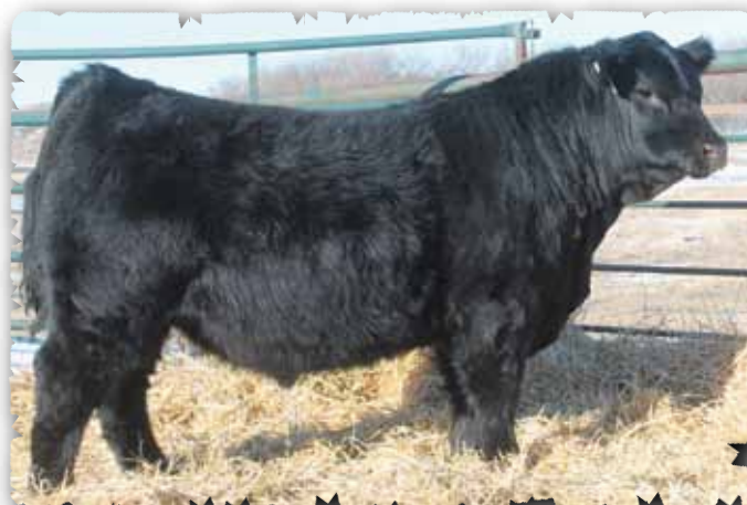
PEAK DOT PRIME 526E - LOT 85

>Recommended for cows >A bull with eye appeal and superb correctness. Yearling ratio of 116 >Bullet dam coes from the famous Annie K cow family.