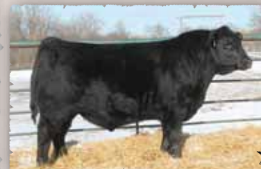
PEAK DOT ELEMENT 249D

Dale Schultz of Glendale Ranch Ltd. purchased a maternal brother to lot 142 in the 2017 spring bull sale.