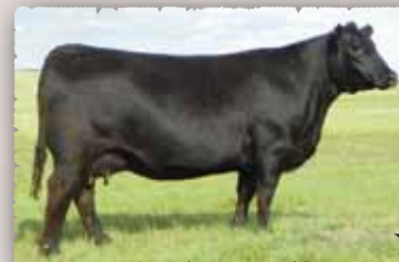
ERICA OF PEAK DOT 478U The dam of Prime

VISIONTOPLINE ROYAL STOCKMAN BW +4.7 VISION UNANIMOUS 1418 WW +73 VISION EDELLA 665 YW +123 PEAK DOT PRIME 733B MILK +12 SAV 004 PREDOMINANT 4438 ERICA OF PEAK DOT 478U ERICA OF PEAK DOT 326R