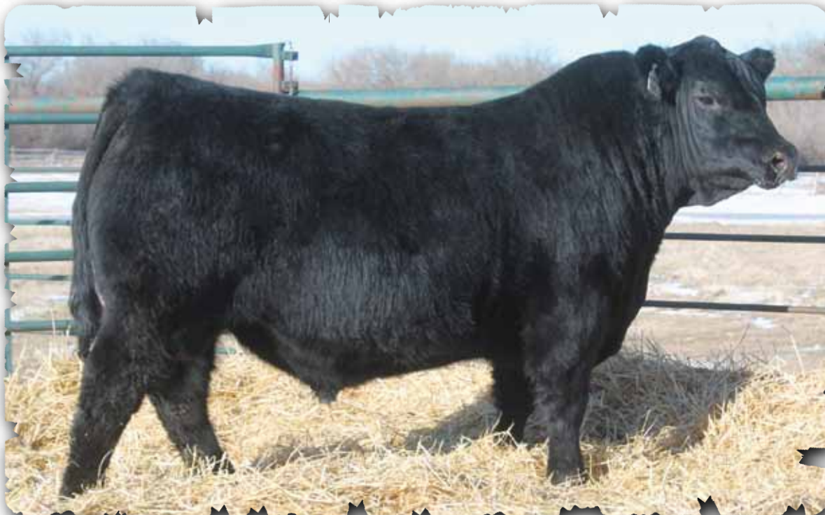
PEAK DOT PRIME 18E - LOT 81