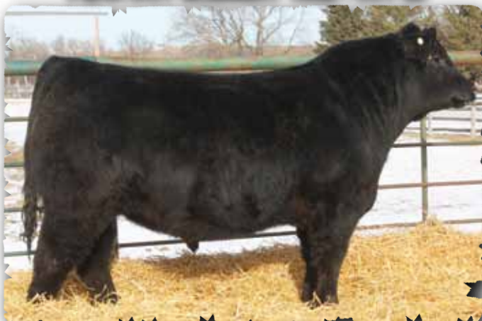
PEAK DOT ELEMENT 2054E - LOT 21