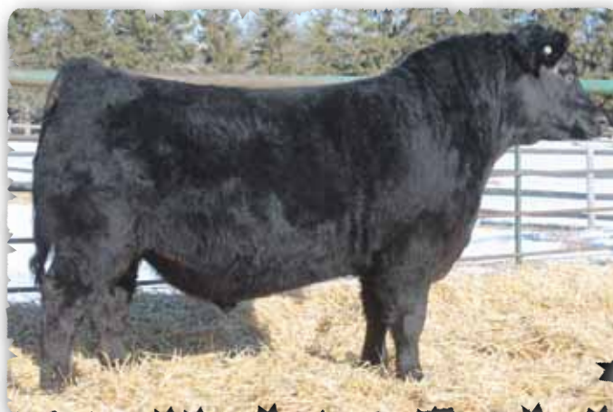
PEAK DOT TOPSOIL 3004E - LOT 120