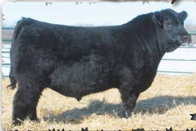
PEAK DOT LIBERTY 16E - LOT 177