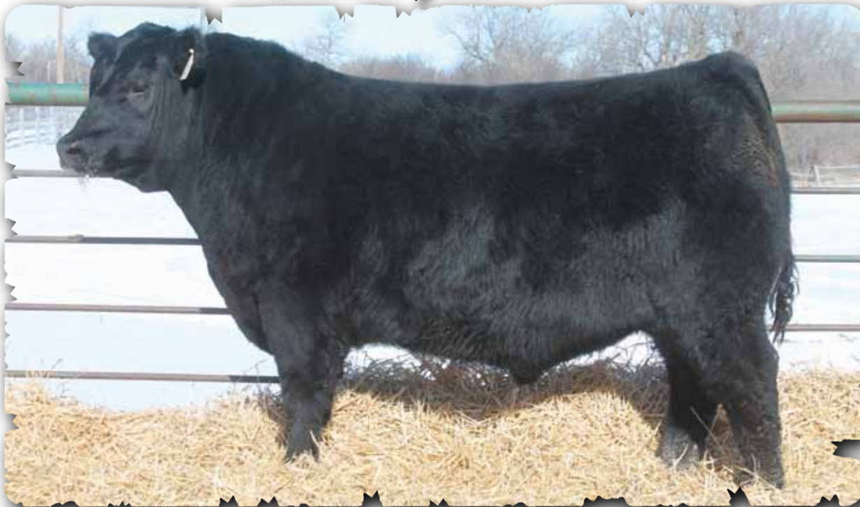
PEAK DOT LIBERTY 415E - LOT 181