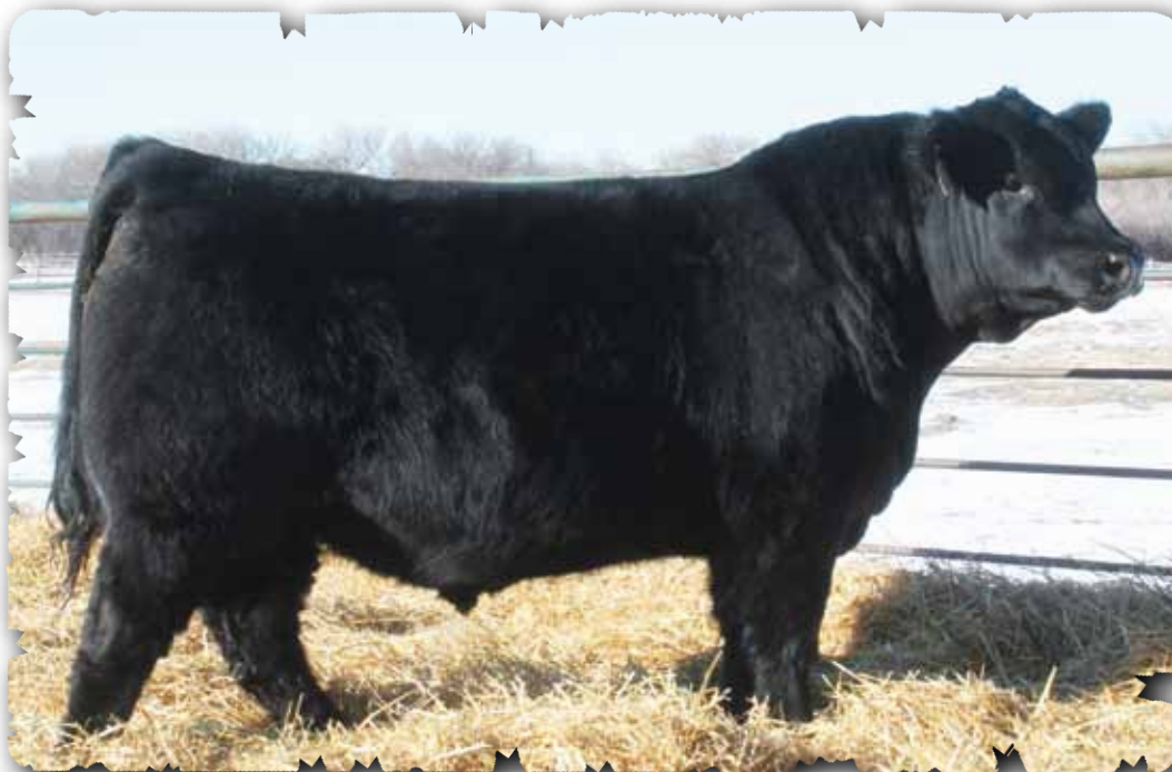
PEAK DOT PRIME 265E - LOT 80