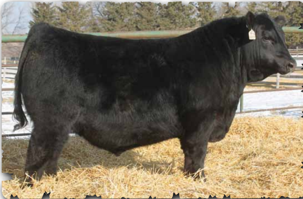
PEAK DOT NO DOUBT 2114E - LOT 47