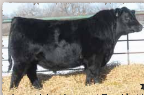
PEAK DOT ELEMENT 102D Purchased by Northway Cattle co.