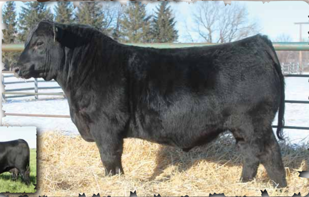
ANNIE K OF PEAK DOT 450U