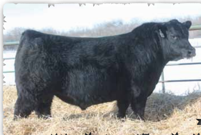
PEAK DOT CASH FLOW 104E - LOT 144