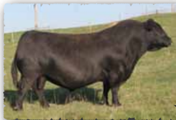
PEAK DOT UNIVERSAL 551A

>Hobson 57N has a production record that reads like a book.