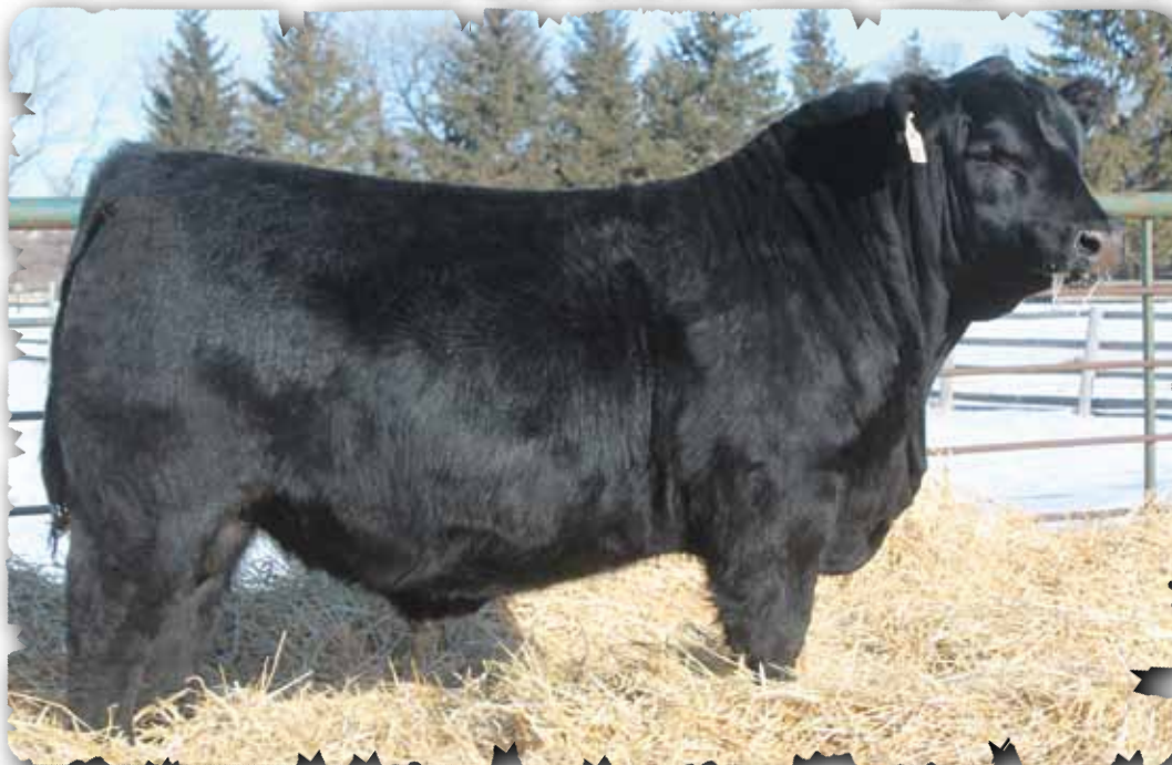
PEAK DOT UNANIMOUS 48E - LOT 58