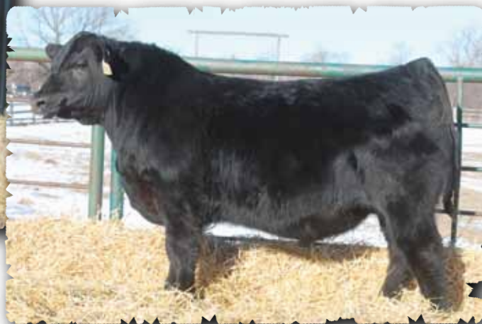
PEAK DOT ELEMENT 2027E - LOT 33