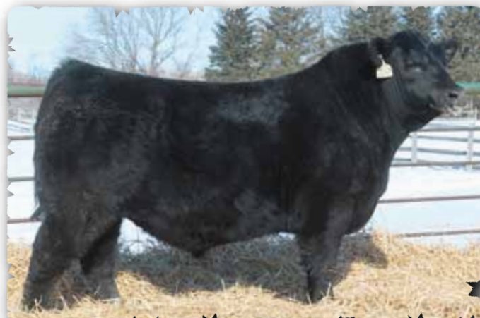
PEAK DOT EASY DECISION 2104E - LOT 159