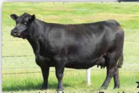
MIA OF PEAK DOT 373T The dam of lot 64