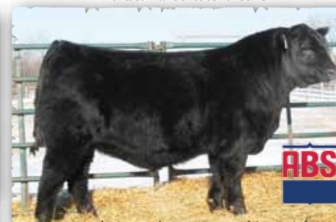
PEAK DOT UNANIMOUS 603A Contact Origen or ABS for semen