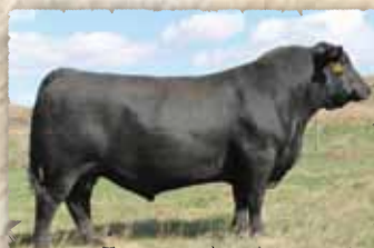
SAV Radiance 0801