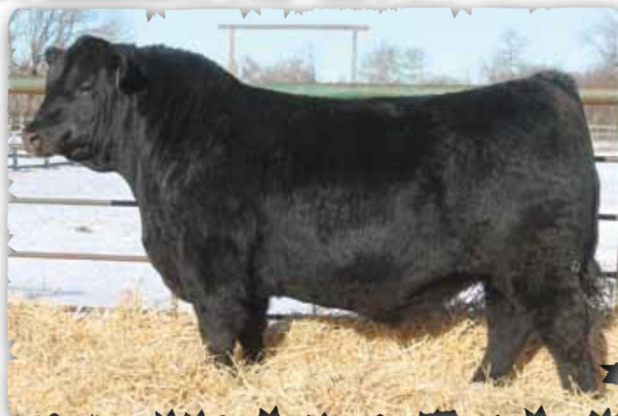
PEAK DOT ELEMENT 95E - LOT 2

>Top 1% for yearling and weaning EPD. Weaning ratio of 120. Young dam has an excellent udder.