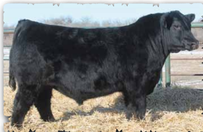
PEAK DOT ELEMENT 28E - LOT 11