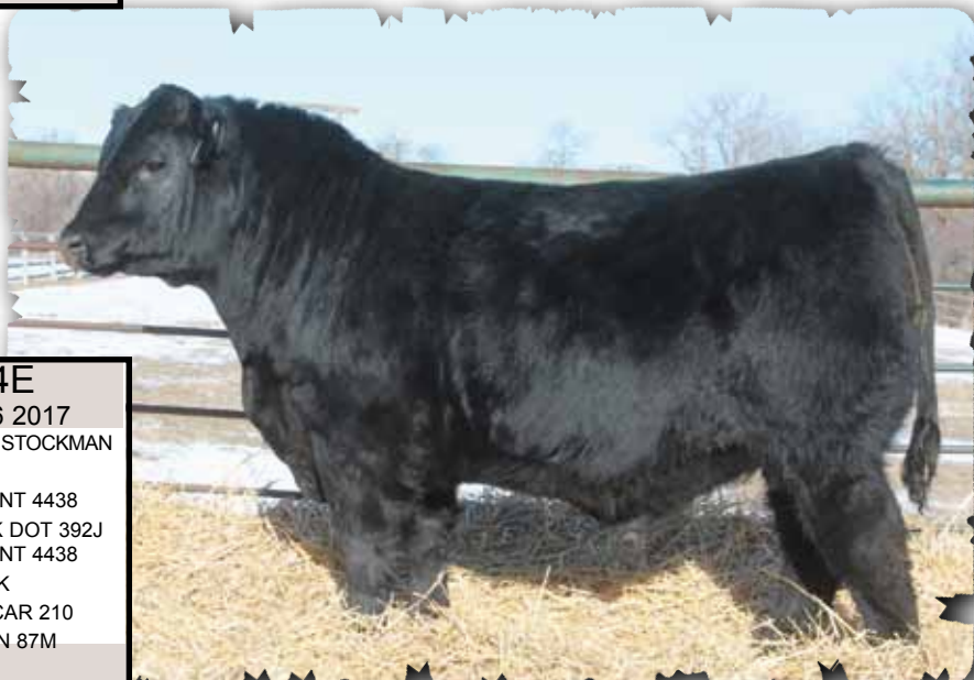
PEAK DOT FOOTHILLS 224E - LOT 76

BW: 68lbs. Adj 205 day Wt: 937 lbs. BW:+0.7 WW: +56 YW: +92 Milk: +17