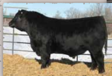
PEAK DOT INTERNATIONAL 1042B The maternal brother to lot 102 purchased by Athabasca Colony

>Recommended for cows or heifers >Good bull, thick and very correct in his structure. Yearling ratio of 112. >Dam is a tremendous Iron Mountain daughter with three daughter retained in the herd.