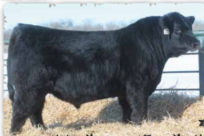
PEAK DOT EASY DECISION 2416E - LOT 155

>Earned a 205 day weight of 943 lbs. for a weaning ratio of 119.