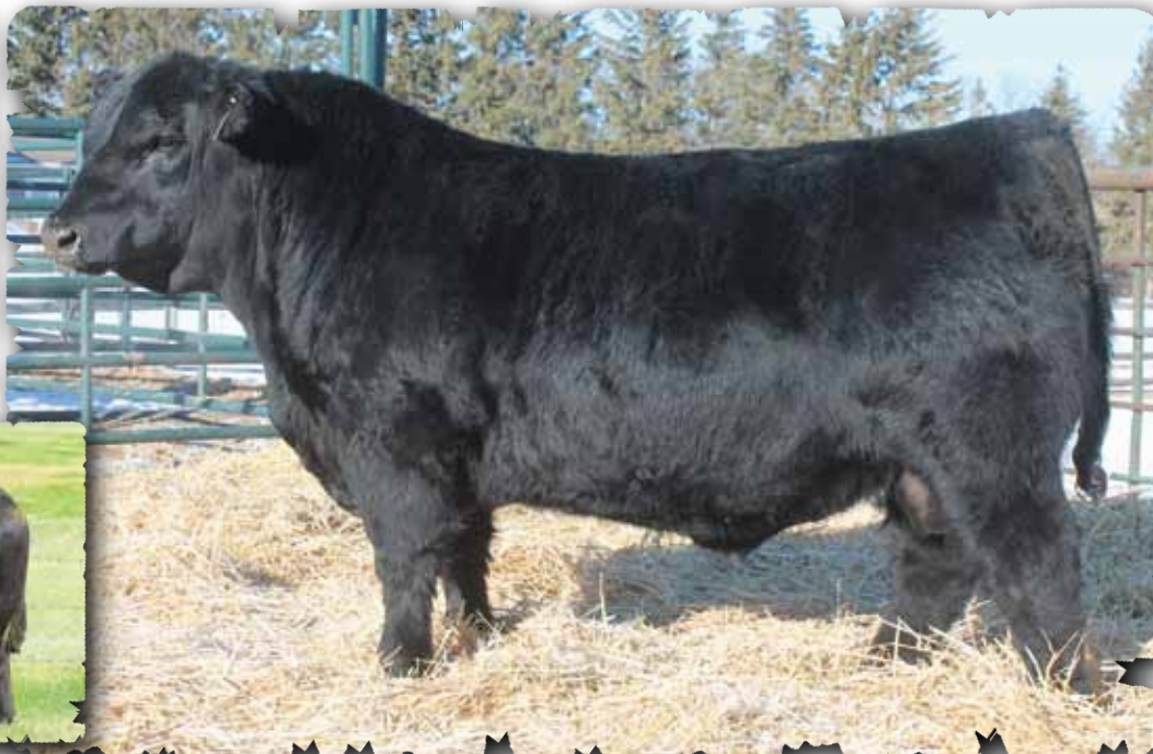
PEAK DOT UNANIMOUS 186E - LOT 64