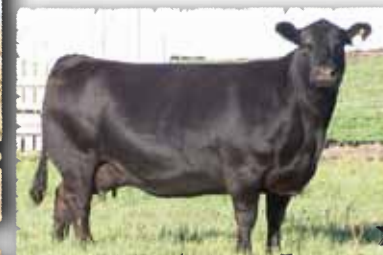
ROSE OF PEAK DOT 643T