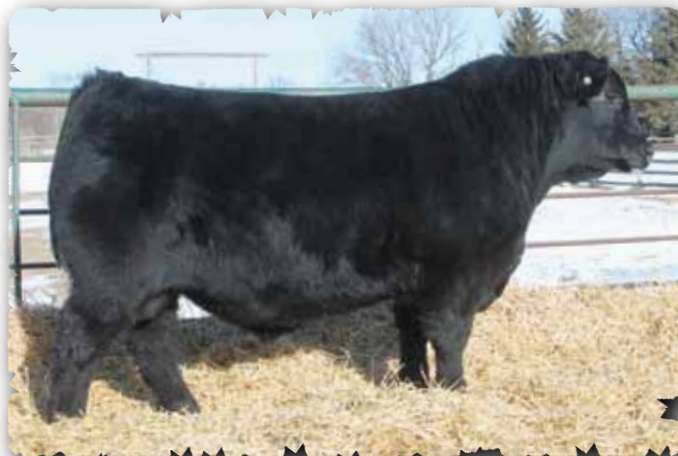
PEAK DOT EARNHARDT 156E - LOT 131

>Dam has produced good ones in the past that have sold to Diamond J Angus and Athabasca Colony.