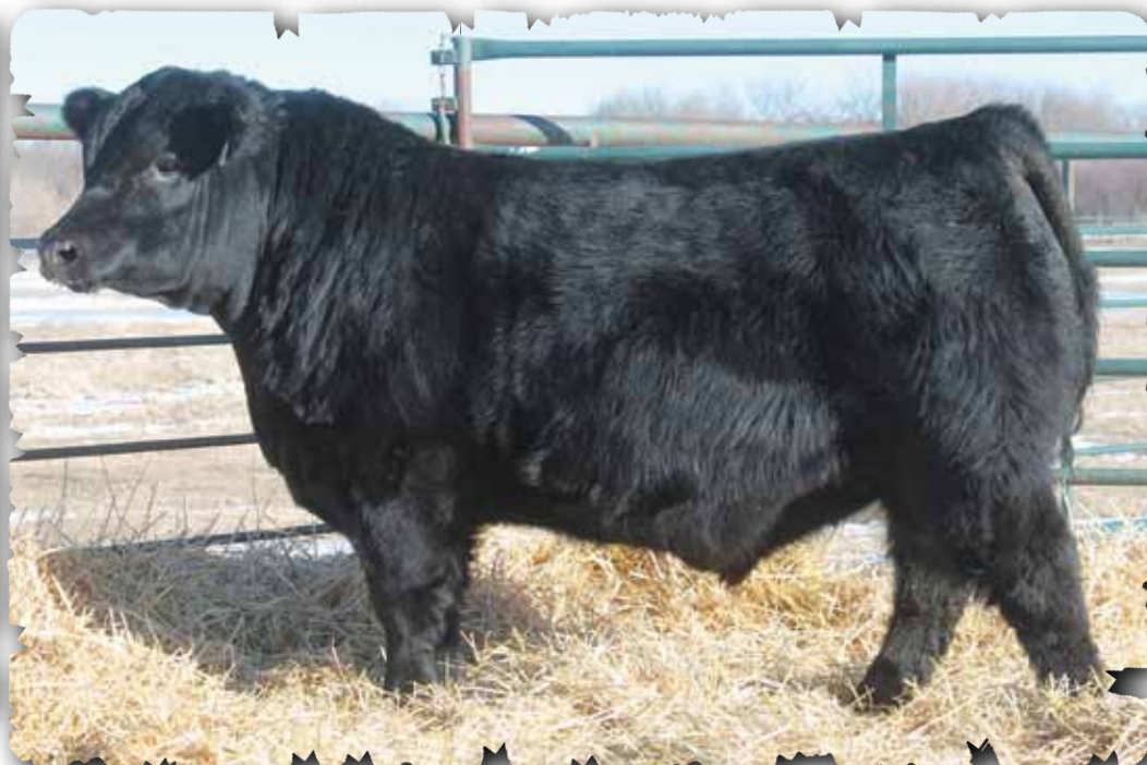
PEAK DOT FOOTHILLS 216E - LOT 77