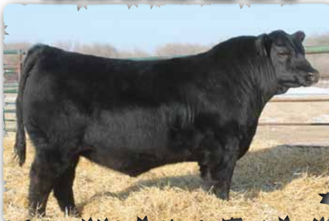
PEAK DOT NO DOUBT 277E - LOT 53