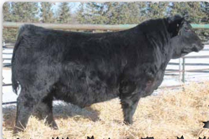
PEAK DOT UNIVERSAL 2184E - LOT 91

The sire of lot 91 and top selling $54,000 bull from the 2014 Spring Sale to Hillcrest Enterprises. Later a semen interest sold to Semex Beef for $30,000.