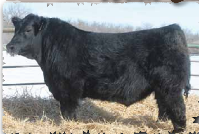
PEAK DOT WIND CHILL 433E - LOT 150