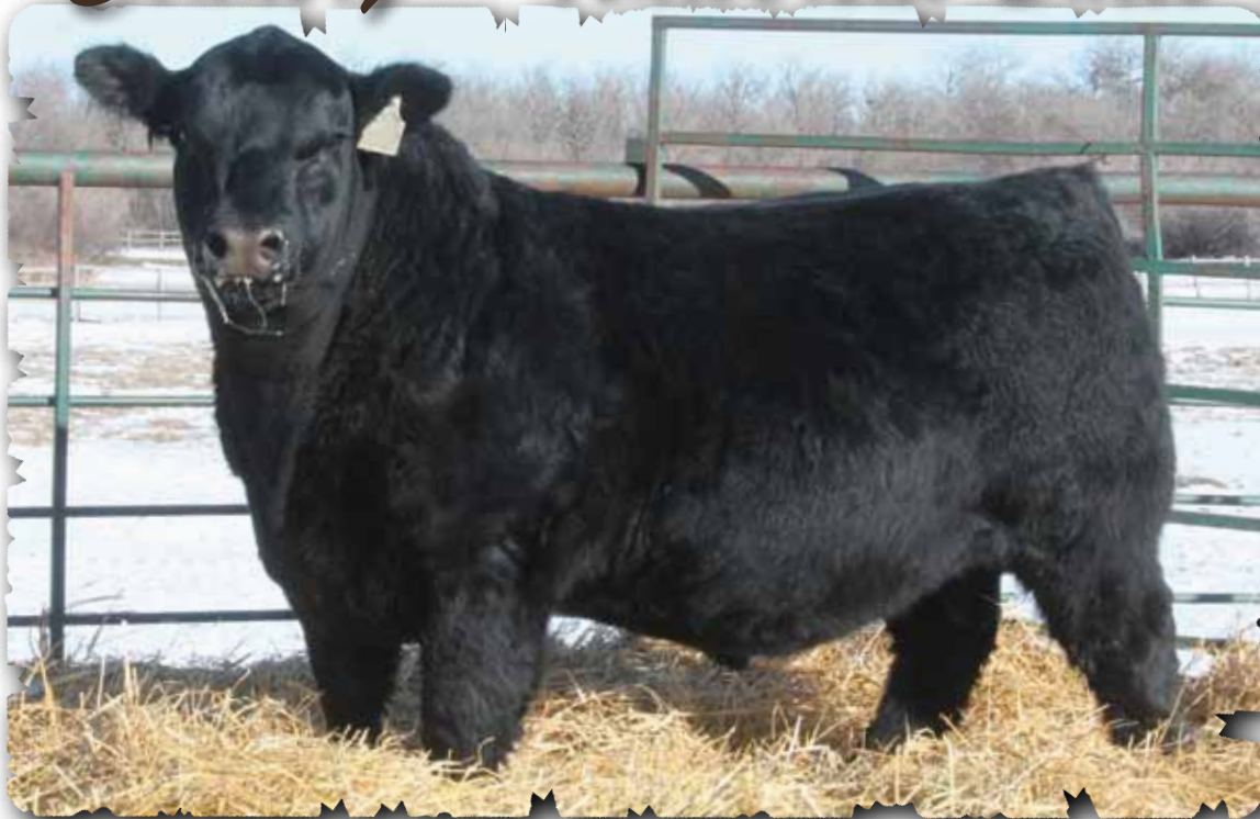
PEAK DOT COUNTRY 202E - LOT 88