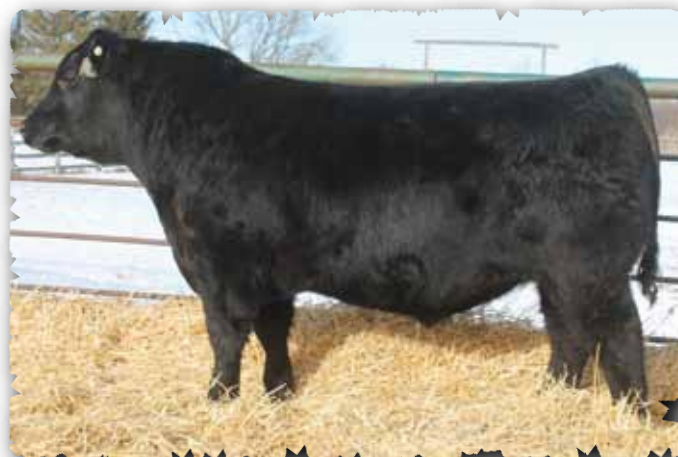
PEAK DOT RENOWN 97E - LOT 114