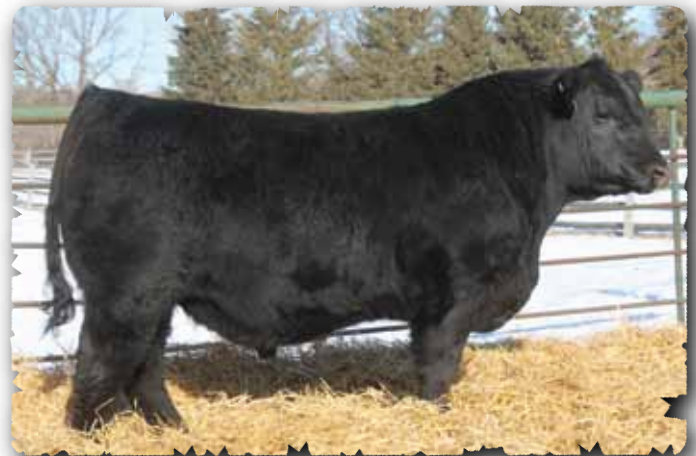
PEAK DOT TOPSOIL 154E - LOT 117

>Dam is a well made, heavy milking Predominant 82S daughter.