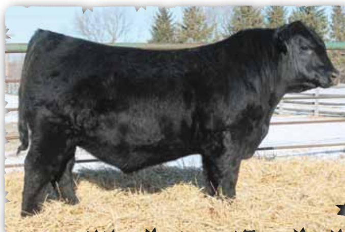
PEAK DOT UNANIMOUS 373E - LOT 63