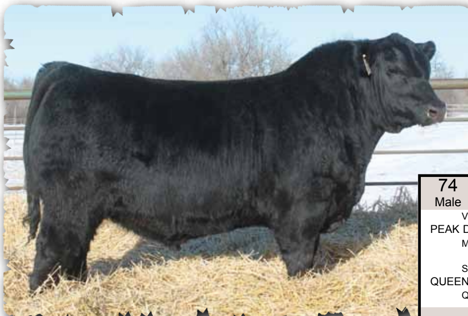
PEAK DOT FOOTHILLS 36E - LOT 74