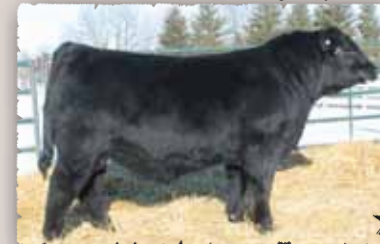
PEAK DOT UNANIMOUS 429B

Jon Scott from Scott Stock Farm purchased a maternal brother to lot 154 in the 2015 spring sale. He has grown into a powerful herd sire breeding volume, dimension and fleshing ability.