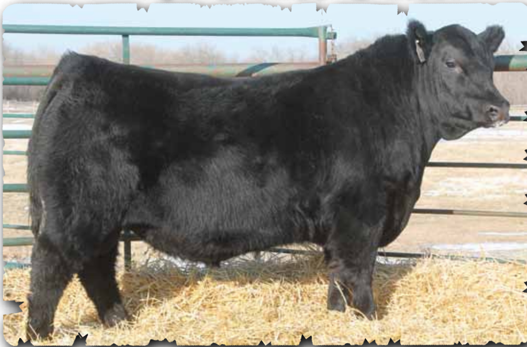
PEAK DOT NO DOUBT 3000E - LOT 39