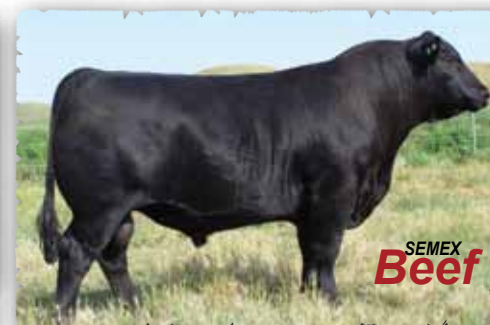
PEAK DOT RESOLUTE 37W Contact Semex for semen