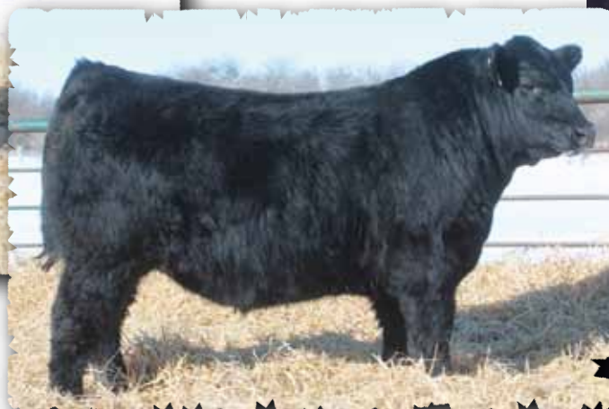
PEAK DOT EASY DECISION 324E - LOT 165