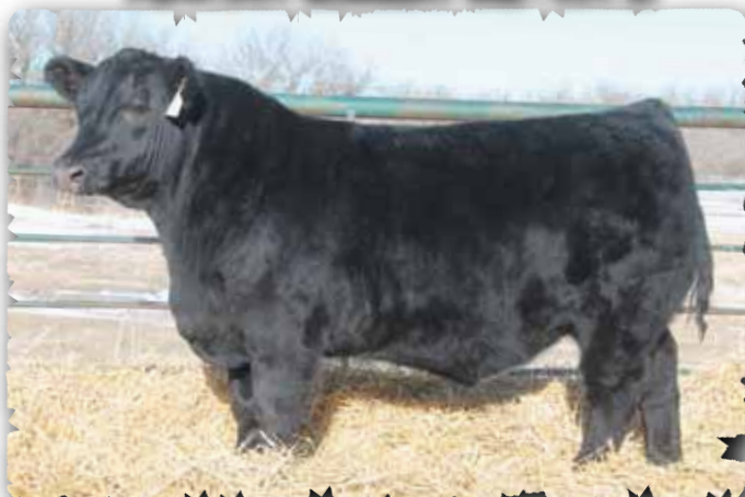
PEAK DOT ELEMENT 2019E - LOT 28