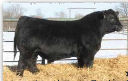
PEAK DOT CASH FLOW 36D

>Recommended for cows. >Offering a bit more bone and hair, this bull is big topped with a powerful rump. 901pounds weaning! >Weaning ratio of 104. >Full brother in blood to the top selling Cashflow son in the 2017 spring sale to Northway Cattle Co. > Dam has true breed character and is one of 33 daughters from Lady of Peak Dot 782L.