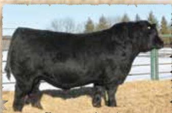
Peak Dot Foothills 1012B