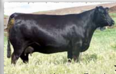
DUCHESS OF PEAK DOT 610T The maternal grandam of lot 44