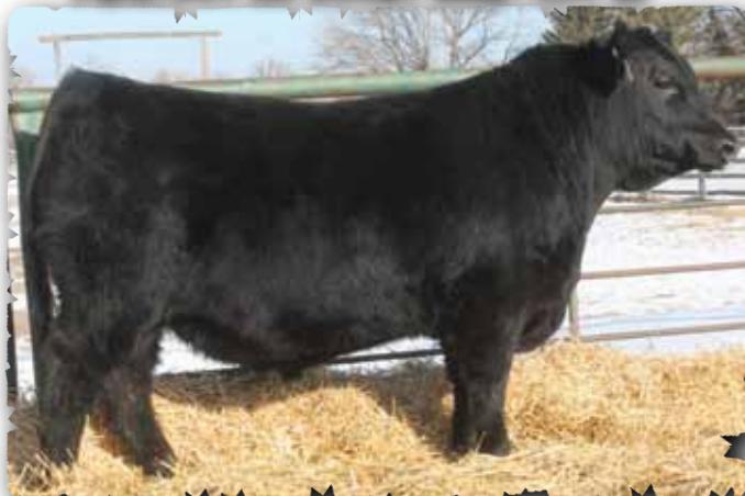
PEAK DOT NO DOUBT 294E - LOT 51