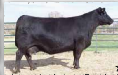
DUCHESS OF PEAK DOT 654N The grandam of lot 39