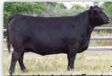
DOUBLE AA ANNIE K 608'01