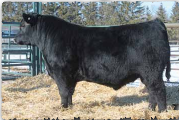
PEAK DOT ELEMENT 98E - LOT 27