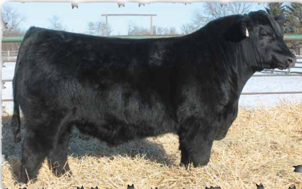
PEAK DOT ELEMENT 290E - LOT 8