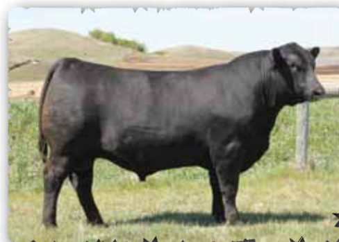
QLC PHANTOM W063

>Dam is a beautiful wedge shaped Proof daughter.