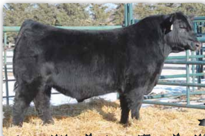
PEAK DOT ELEMENT 350E - LOT 19