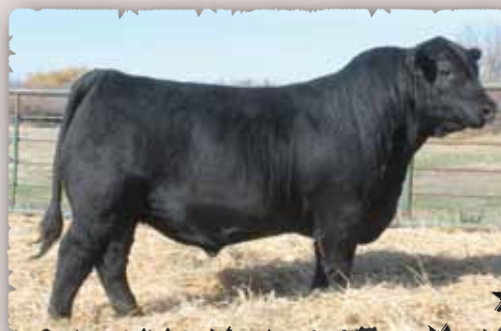
PEAK DOT ELEMENT 2106D Purchased by Bandura Ranches..