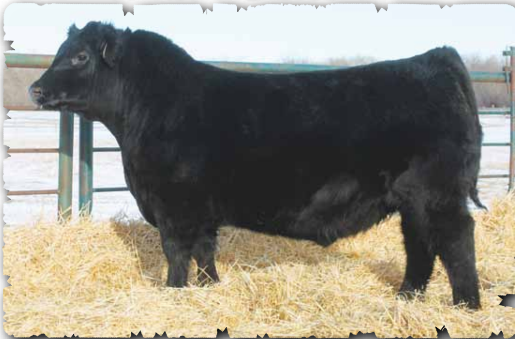
PEAK DOT HONOR 198E - LOT 103