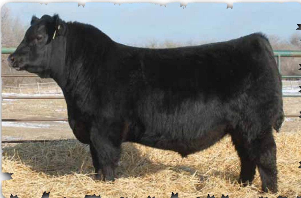
PEAK DOT NO DOUBT 30E - LOT 42