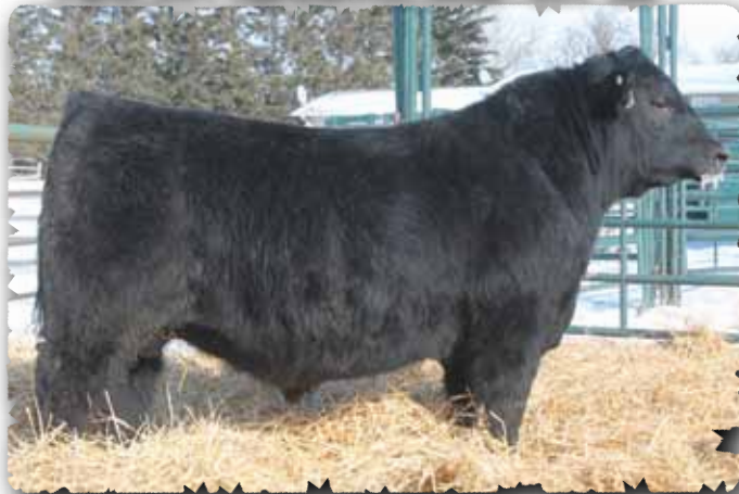
PEAK DOT HERDBOOK 77E - LOT 184