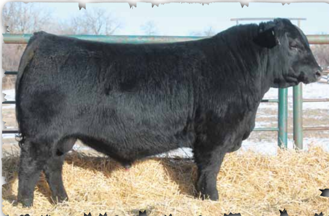
PEAK DOT UNANIMOUS 368E - LOT 67