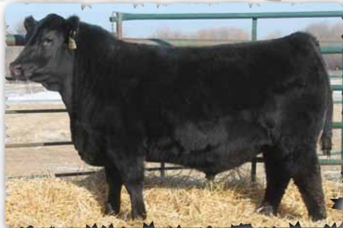
PEAK DOT NO DOUBT 2103E - LOT 54