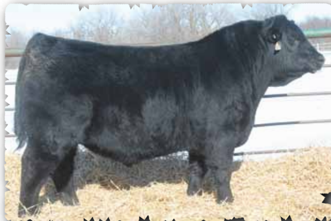
PEAK DOT EASY DECISION 2119E - LOT 162