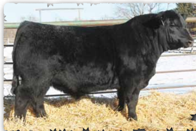
PEAK DOT SEEDSTOCK 80E - LOT 97

>Dam is a heavy milking Unanimous daughter. that ranks in the top 2% for weaning and yearling EPDs.