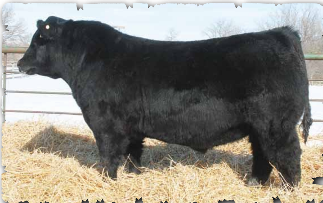
PEAK DOT CASH FLOW 13E - LOT 140