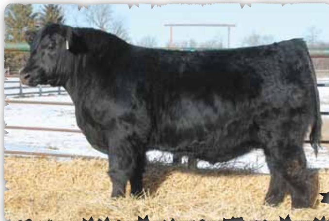
PEAK DOT ELEMENT 2009E - LOT 25

>Grandam is a past embryo donor with 46 progeny.