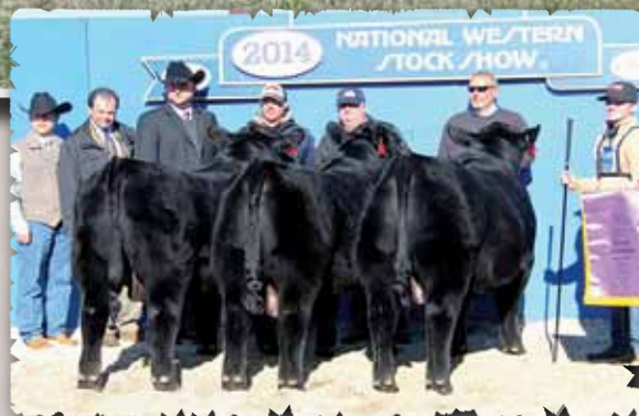
2014 National Western Stock Show Champion Pen Easy Decision was the lead bull in the 2014 Champion Pen of bulls

Easy Decision a big time performance bull that is rapidly becoming one of the most popular new bulls in the Angus breed. His first two calf crops have exceeded all expectations and have proven him as a low birth weight sire that consistently breeds added pounds at weaning and structural soundness. Easy Decision is backed by four consecutive generations of Pathfinder dams. Easy Decision was the lead bull of the 2014 National Western Stock Show Champion pen of 3 bulls. Easy Decision first calf crop was the feature attraction of the 2016 Peak Dot bull sale with the top 5 sons averaging $35,500.