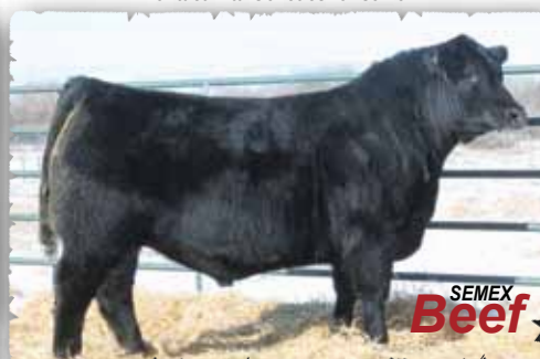
PEAK DOT ENFORCER 8A Contact Semex for semen