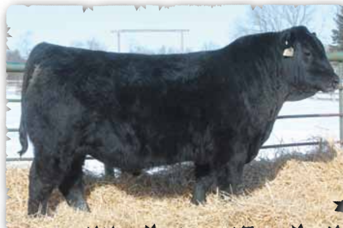
PEAK DOT EASY DECISION 2099E - LOT 156