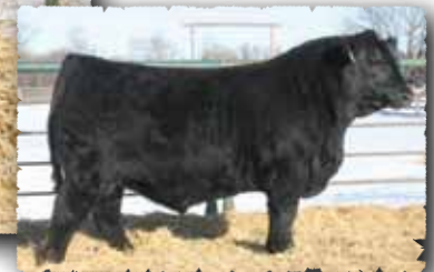
PEAK DOT UNANIMOUS 141C

The maternal brother of lot 118 Purchased by HBH Farms Inc.