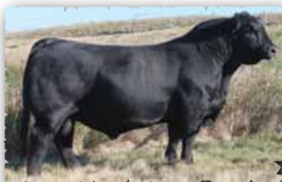
PEAK DOT PRIME 733B

The full brother to lot 58-59 and 60 Selected by Alta Genetics