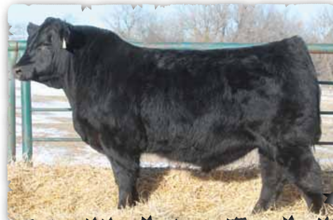
PEAK DOT ELEMENT 2036E - LOT 26