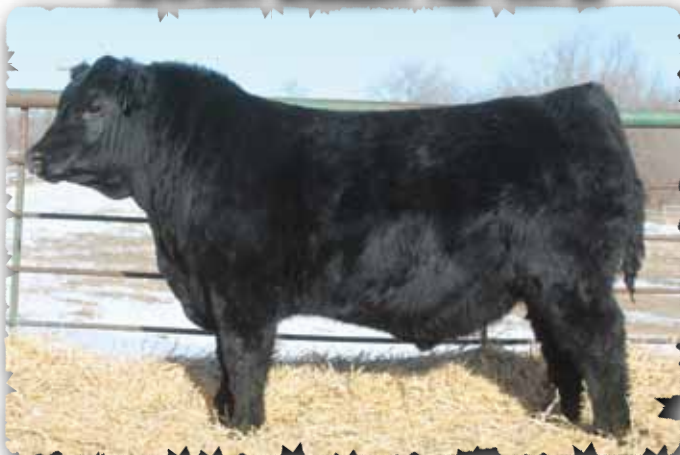
PEAK DOT ELEMENT 2007E - LOT 30