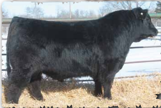
PEAK DOT HERDBOOK 522E - LOT 182