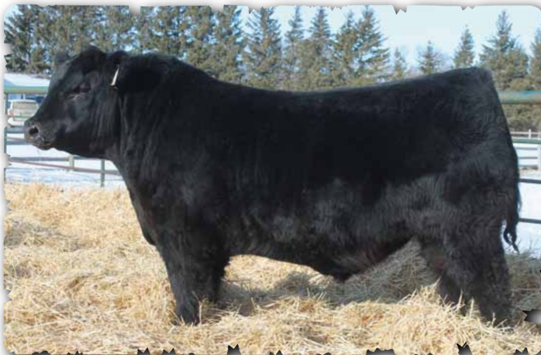
PEAK DOT CASH FLOW 158E - LOT 139