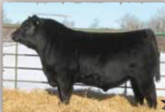
Peak Dot No Doubt 280D Maternal brother to lot 77

Owen Cairns owner of Hillcrest Enterprise purchased a maternal brother to lot 77 in the 2017 Spring Sale.