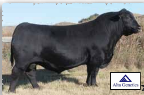
PEAK DOT COUNTRY 604B Contact Alta Genetics for semen