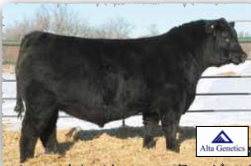
PEAK DOT LIBERTY 117C Contact Alta Genetics for semen