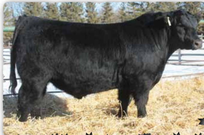
PEAK DOT ELEMENT 23E - LOT 6

>Dam is one of the lower birth EPD cows at Peak Dot.