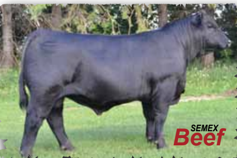
PEAK DOT OUTLOOK 271C Contact Semex for semen