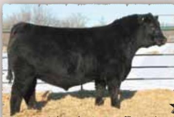
PEAK DOT LIBERTY 117C Purchased by Alta Genetics .