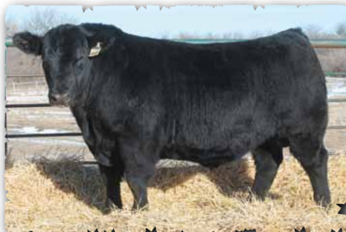
PEAK DOT RENOWN 110E - LOT 113

>Dam ranks in the top 2% for weaning and yearling and top 3% for milk EPDs.