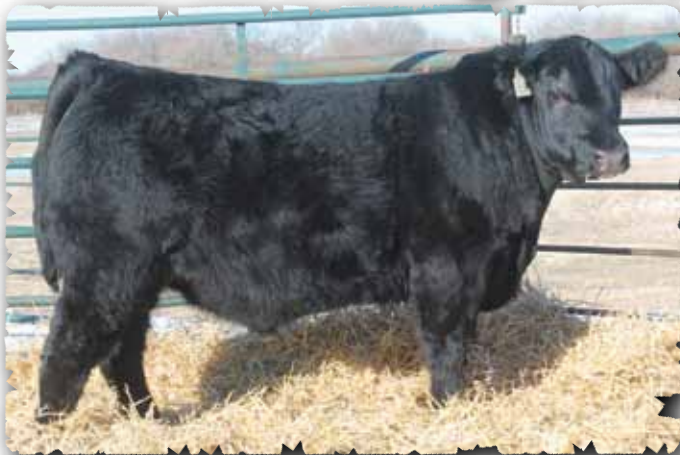
PEAK DOT ELEMENT 188E - LOT 20