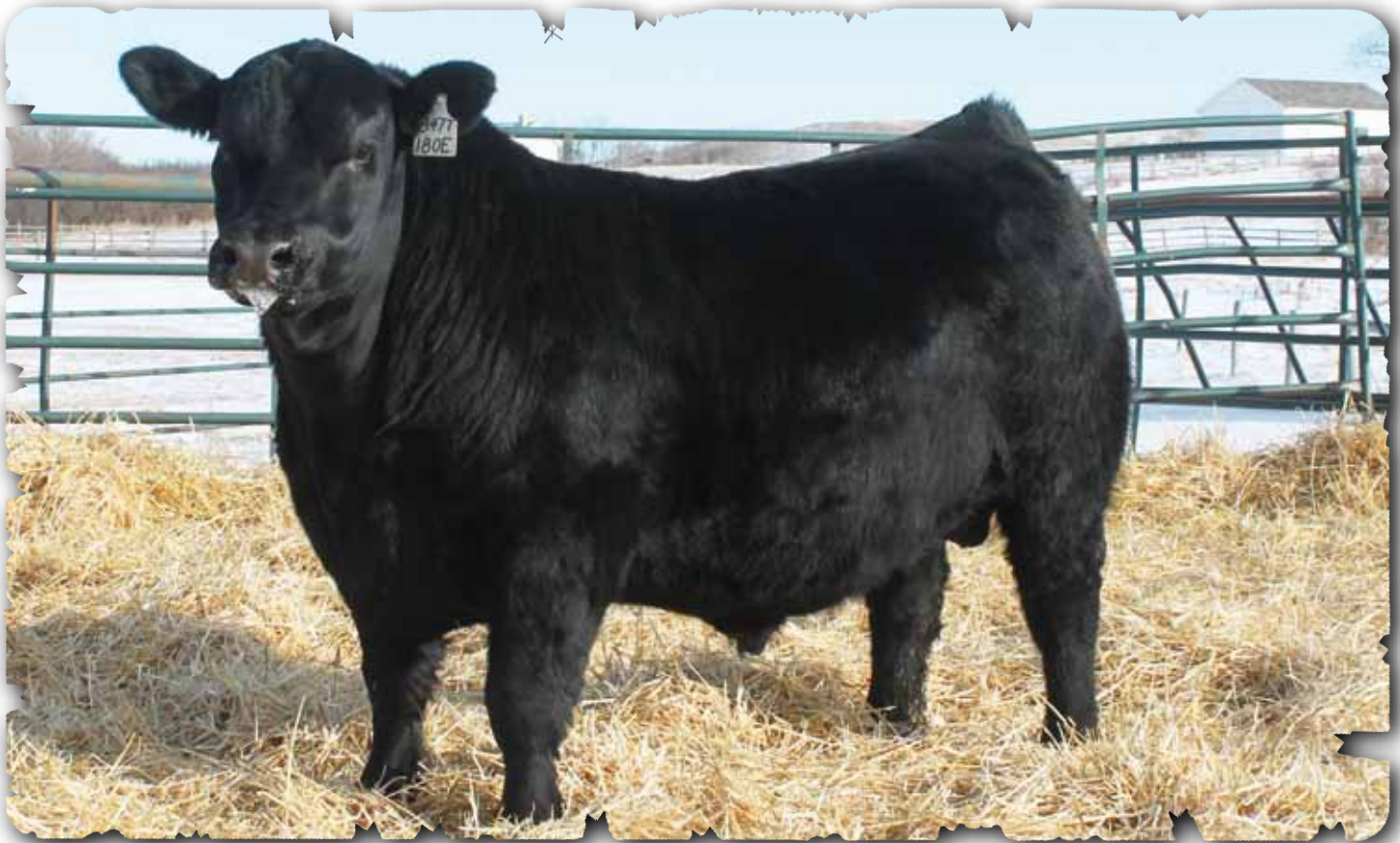
PEAK DOT NO DOUBT 180E - LOT 37