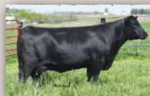
SAV MISS BOBBIE 2407 The dam of Earnhardt

Earnhardt is a stout and powerful son of SAV Harvester 0338 out of the uniquely bred and perfectly built SAV Miss Bobbie 2407. He was the top weaning bull of his entire calf crop at Janssen Angus. He offers a moderate birth weight with a 205 day weight of 977 pounds along with a 365-day weight that broke the 1,400 pound yearling weight barrier. A large number of Earnhardt and Top Soil daughters have been retained by Peak Dot for replacements.