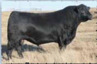
4M Element 405