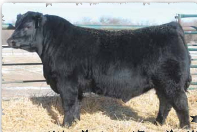
PEAK DOT SEEDSTOCK 206E - LOT 95

>Maternal sisters at Peak Dot, Northway Cattle Co and RL7 Ranch Inc.