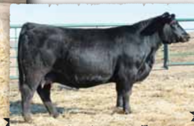
LADY OF PEAK DOT 807X The dam of lot 119