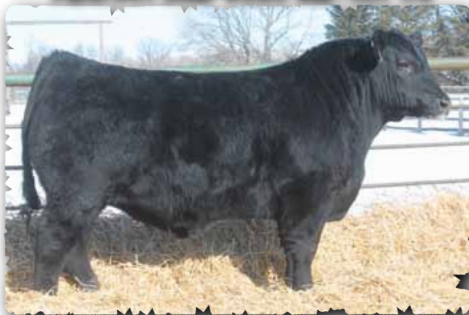
PEAK DOT JUMP START 288E - LOT 174