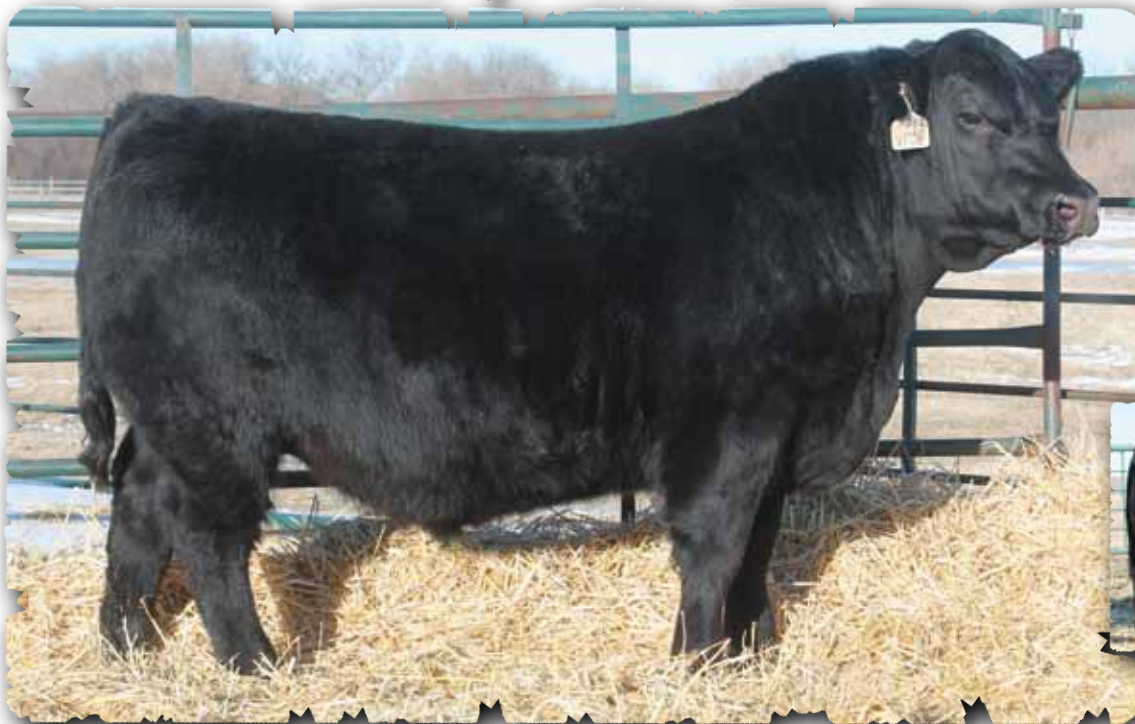
PEAK DOT TOPSOIL 2162E - LOT 119