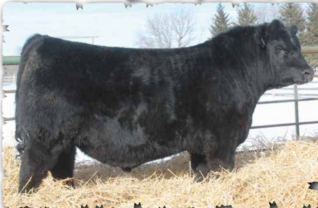
PEAK DOT CASH FLOW 254E - LOT 142