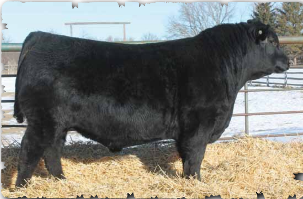
PEAK DOT RADIANCE 221E - LOT 108