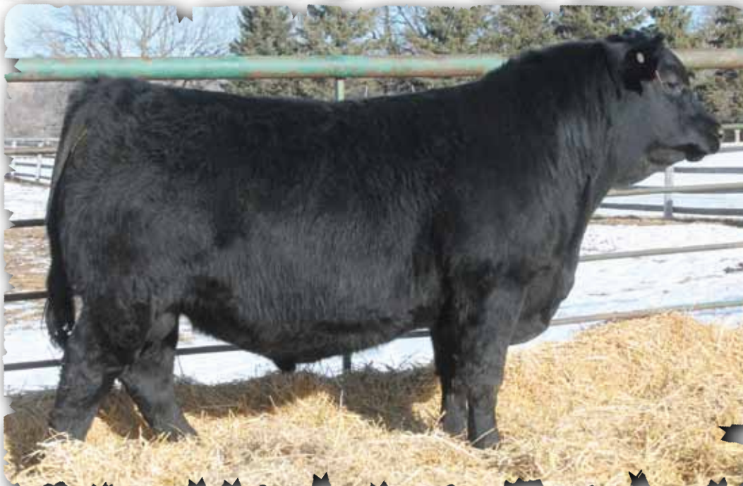
PEAK DOT UNANIMOUS 245E - LOT 71