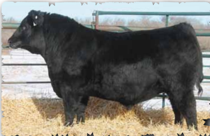
PEAK DOT NO DOUBT 180E - LOT 37