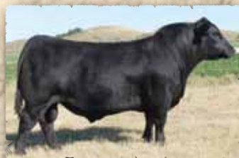
KR Cash Flow