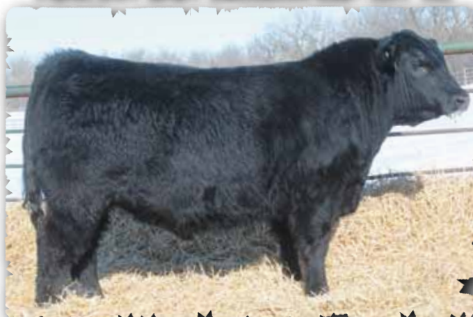
PEAK DOT EASY DECISION 335E - LOT 167