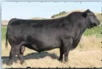
Vision Unanimous 1418