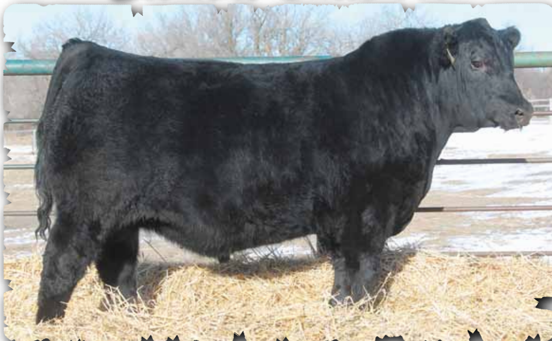
PEAK DOT ELEMENT 87E - LOT 15