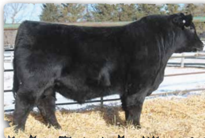
PEAK DOT UNANIMOUS 295E - LOT 68