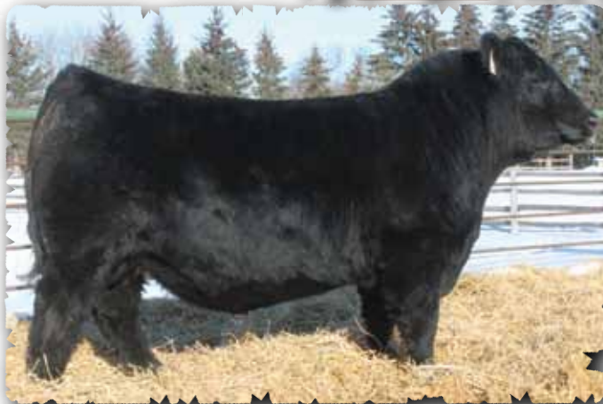
PEAK DOT NO DOUBT 338E - LOT 50