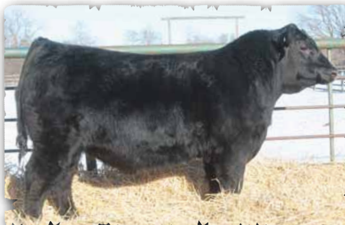
PEAK DOT ELEMENT 2408E - LOT 13

>Nice fronted beautiful uddered dam by Eliminator 723A