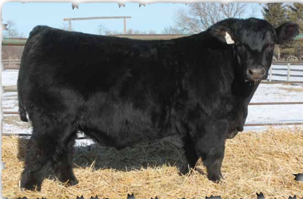
PEAK DOT EARNHARDT 240E - LOT 135