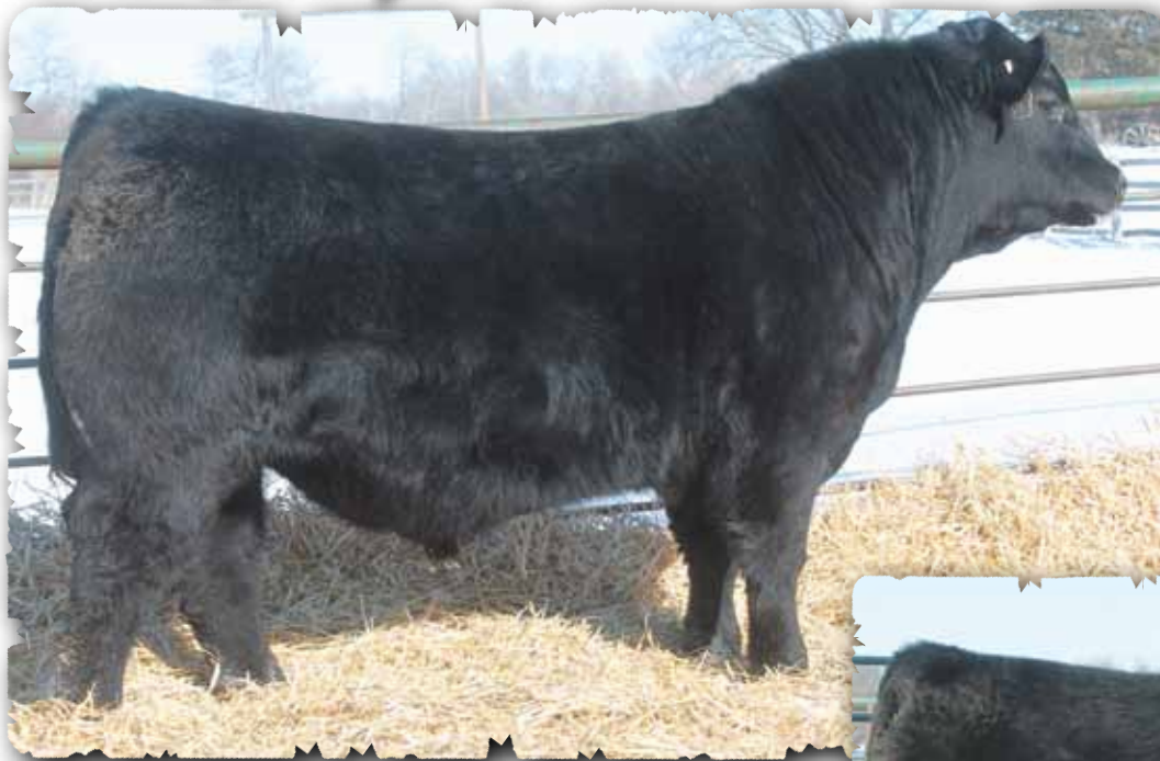
PEAK DOT EASY DECISION 2046E - LOT 160