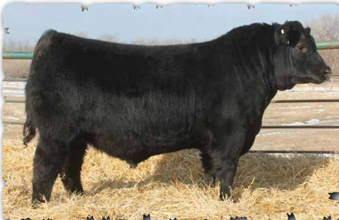
PEAK DOT LIBERTY 289E - LOT 176

Featured $47,000 second high selling bull at Peak Dot Ranch 2016 spring bull sale to Alta Genetics. Liberty is gaining worldwide attention for his growth and performance combined with eye-appealing phenotype. You will appreciate his first set of son's outstanding width across their tops and nice heads.