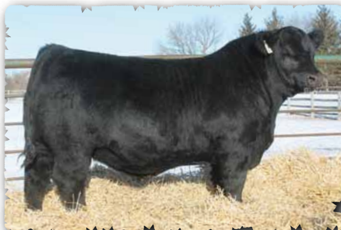
PEAK DOT UNANIMOUS 5E - LOT 62

>Recommended for cows >A bull with added performance and length. Ranks in the top 1% for weaning EPD. Weaning ratio of 118. >Dam is heavy milking Capacity daughter that has progeny at Northway Cattle Co. Lloyd Clarke and Solberge Livestock