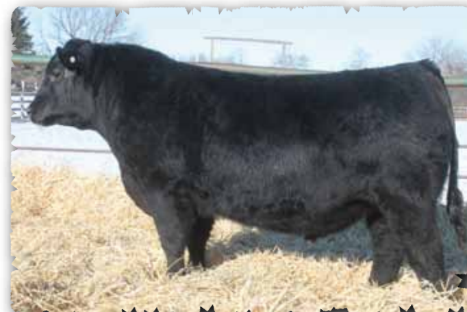
PEAK DOT ELEMENT 114E - LOT 3

>Dam has three daughters active at Peak Dot. Grandam is an Elite dam.