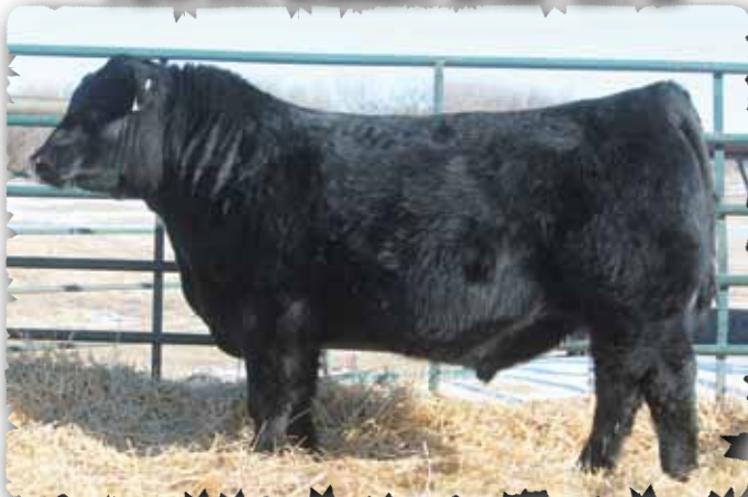
PEAK DOT ELEMENT 73E - LOT 29