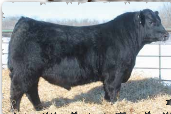
PEAK DOT EASY DECISION 99E - LOT 166