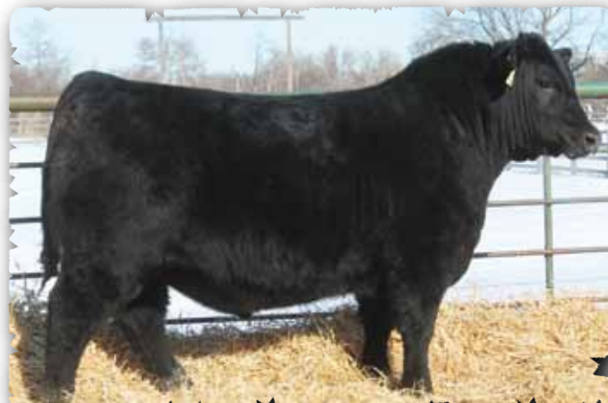
PEAK DOT EASY DECISION 2017E - LOT 158

>Recommended for heifers >A low birth bull that is very broad and wide backed. Weaning ratio 105. >Ranks in the top 1% for weaning and yearling EPDs.