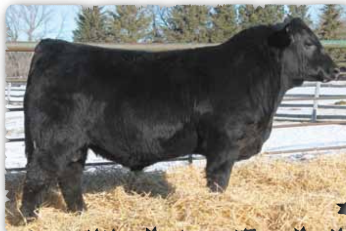
PEAK DOT UNANIMOUS 305E - LOT 72

>Maternal brothers sold to Kevin Forwood, Jack Gunter and Caragata Ranch.