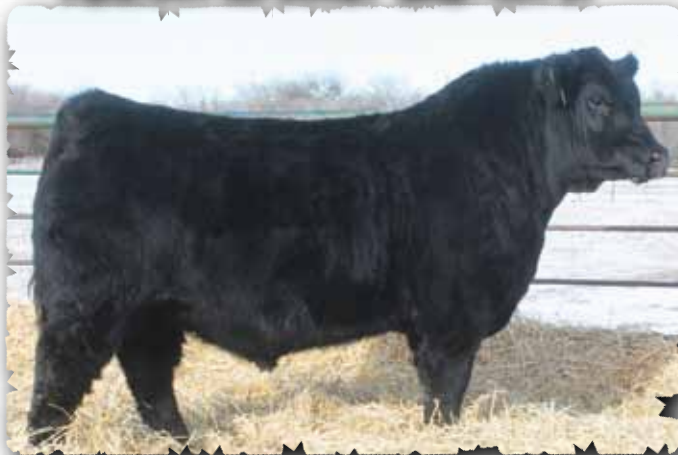
PEAK DOT NO DOUBT 432E - LOT 52