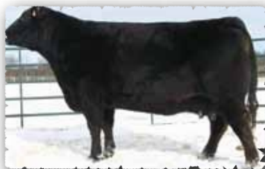
LADY OF PEAK DOT 782L The maternal grandam of lot 117