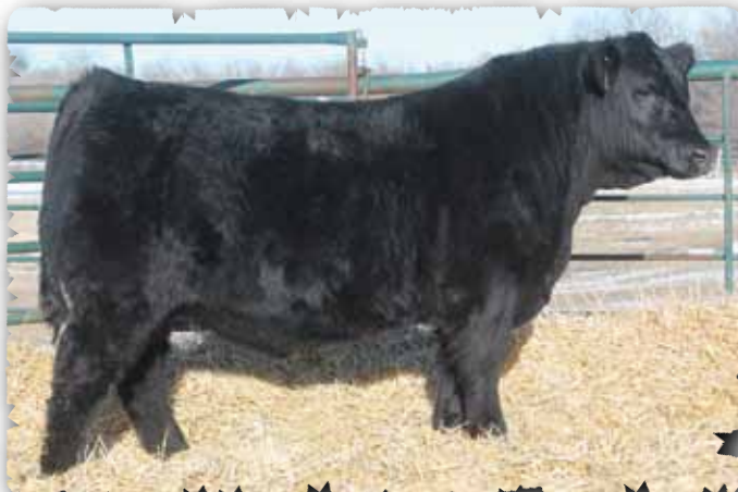
PEAK DOT EARNHARDT 271E - LOT 133