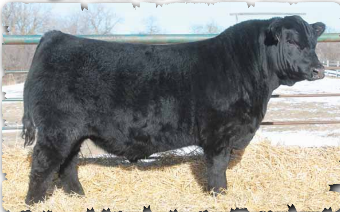
PEAK DOT EARNHARDT 178E - LOT 129