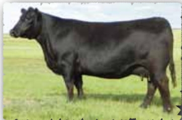
ERICA OF PEAK DOT 478U The dam of lot 93