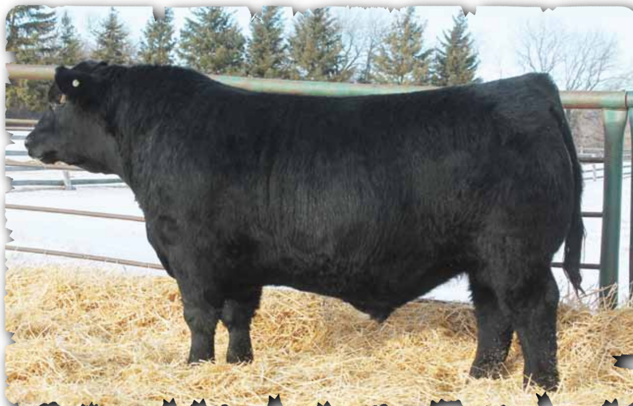
PEAK DOT RENOWN 94E - LOT 111

SAV Renown is the $175,000 lead-off bull from the 2014 SAV sale. He is one of the most popular, respected and highly sought after sires in the Angus world. His progeny have structural balance, growth, muscle, performance and docility. SAV Renown is a maternal brother to SAV Honor and SAV Seedstock.