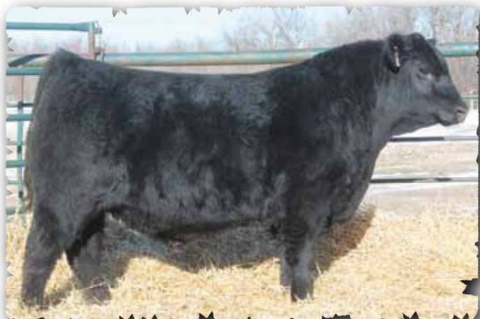
PEAK DOT RADIANCE 325E - LOT 110