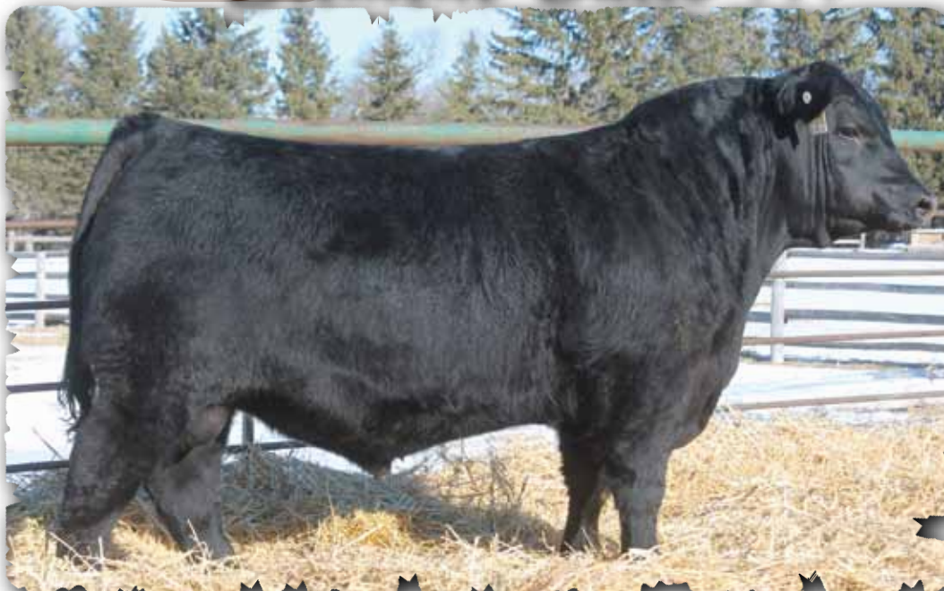
PEAK DOT ELEMENT 42E - LOT 12