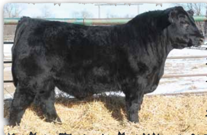
PEAK DOT ELEMENT 235E - LOT 10

>Dam comes from a long line of great cows. Dam, grandam and great grandam have all been embryo donors.