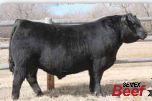
PEAK DOT UNIVERSAL 551A Contact Semex for semen