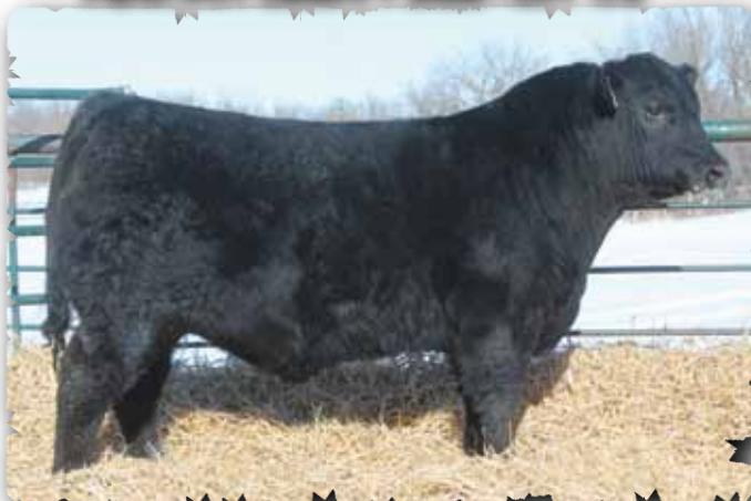
PEAK DOT LIBERTY 332E - LOT 179