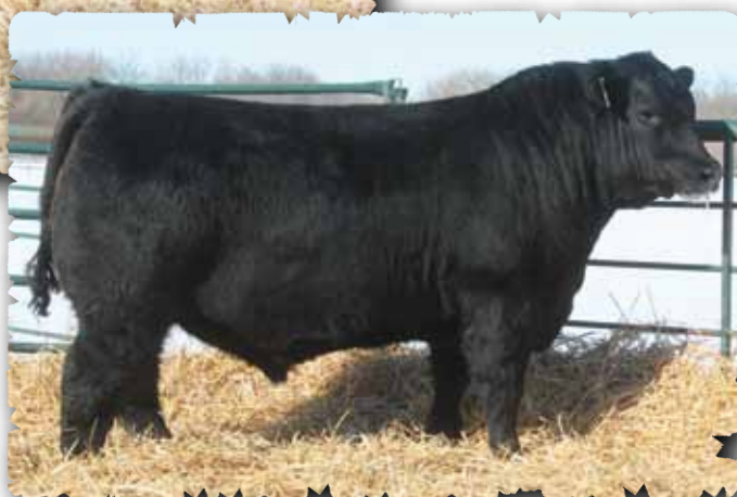
PEAK DOT JUMP START 53E - LOT 173

>Dam has been very productive. Grandam is a donor cow.