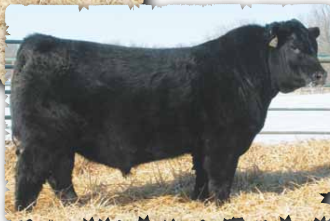
PEAK DOT EASY DECISION 2028E - LOT 161