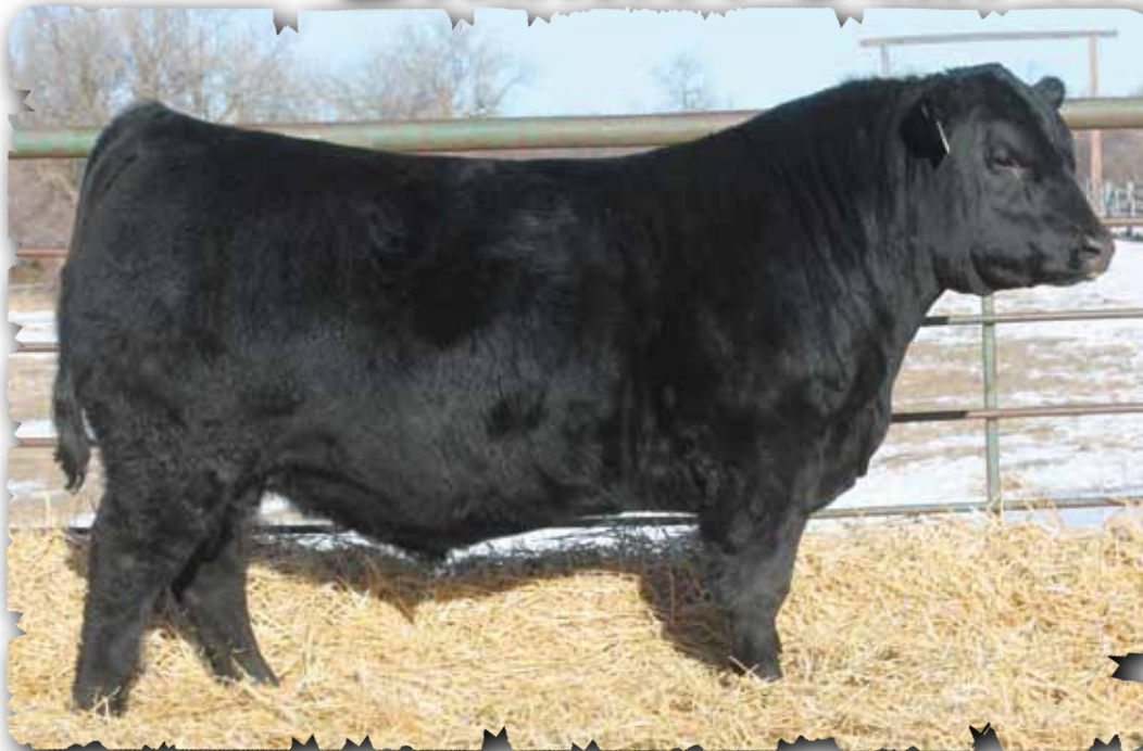
PEAK DOT SEEDSTOCK 218E - LOT 96