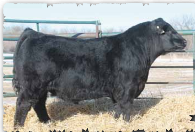
PEAK DOT ELEMENT 118E - LOT 16

>Dam is a young stout wide based daughter of Eliminator 723A.