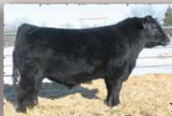
PEAK DOT JUMP START 142C Purchased by Semex .