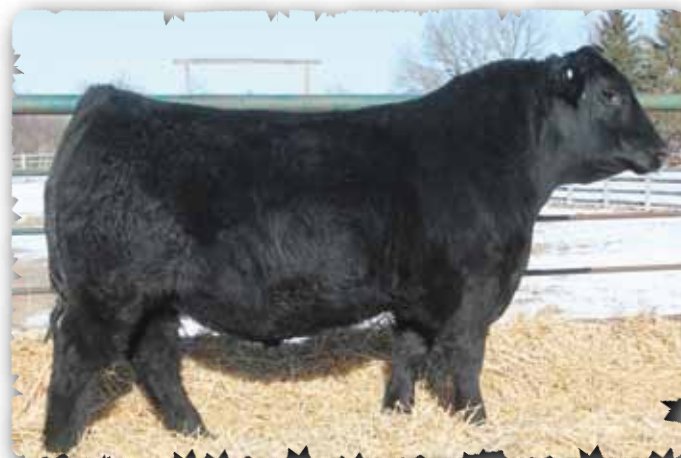
PEAK DOT NO DOUBT 2159E - LOT 46