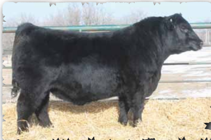
PEAK DOT NO DOUBT 278E - LOT 48