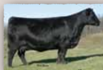
SAV ELBA 7099 The maternal great grandam of Radiance