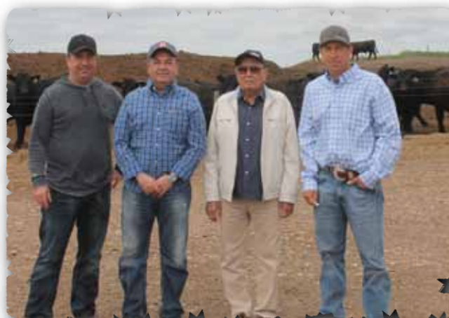
Visitors Bopil Farms Brazil

>Recommended for cows >A long bodied free moving bull that will cover a lot of ground. >Grandam and great grandam are past embryo donors.