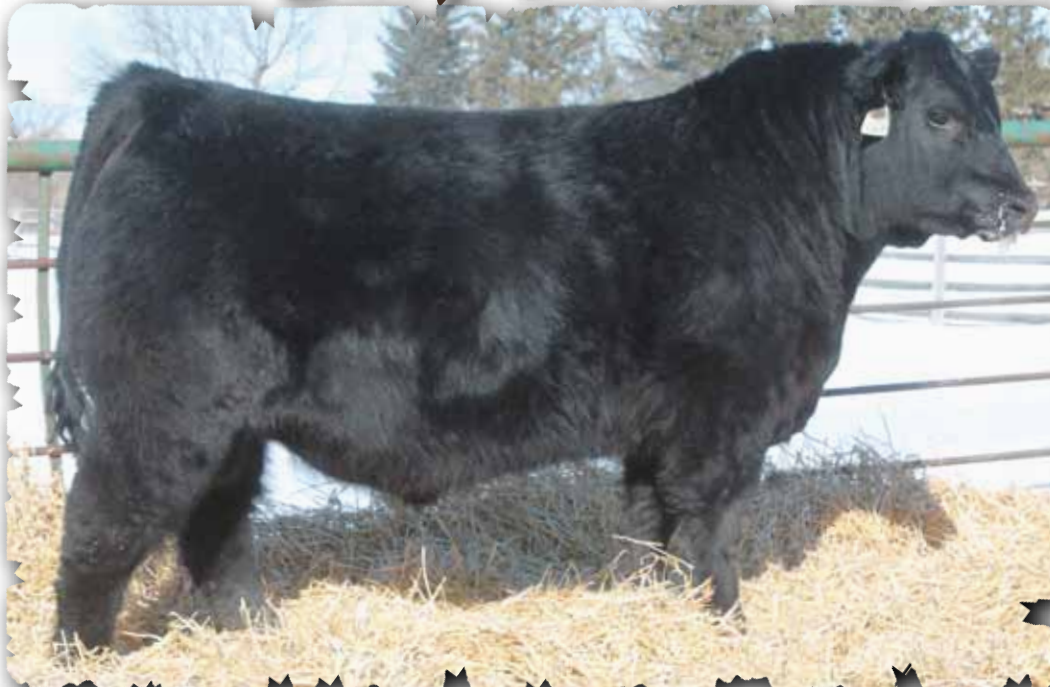
PEAK DOT EASY DECISION 2164E - LOT 154