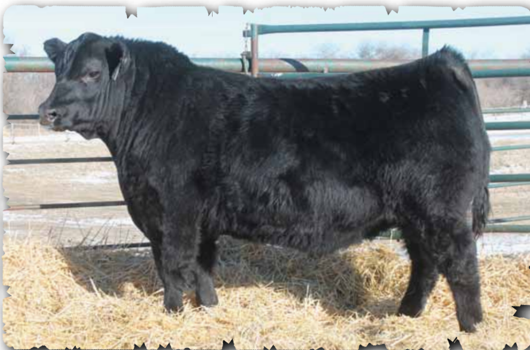
PEAK DOT RENOWN 89E - LOT 112