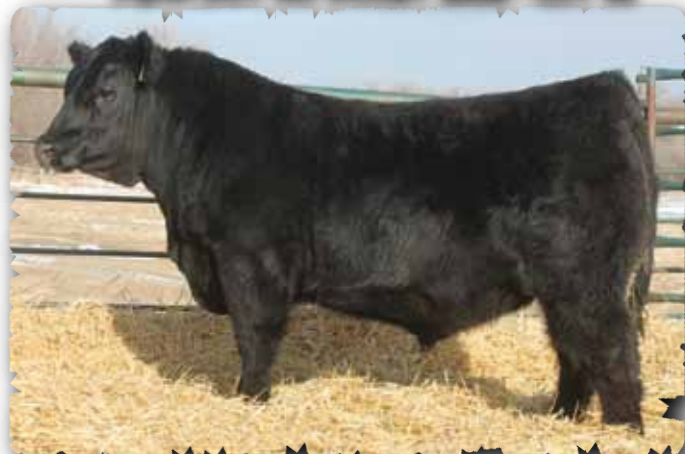
PEAK DOT NO DOUBT 81E - LOT 56