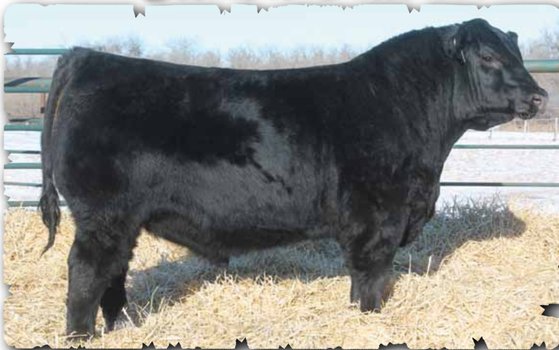
PEAK DOT ELEMENT 282E - LOT 4