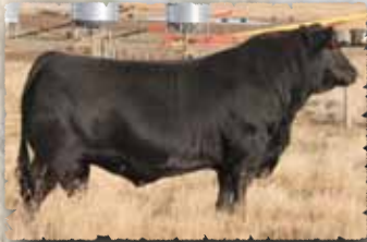
Janssen Earnhardt 5003