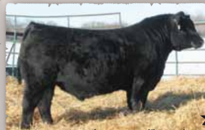
PEAK DOT ELEMENT 2006D

Full brother to lot 9 Sold to Alleman Land & Livestock