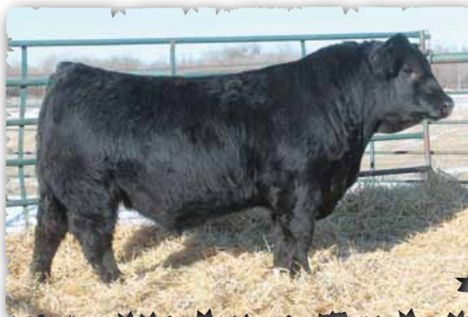
PEAK DOT CASH FLOW 227E - LOT 143

>Dam is one of 33 daughters from the matriarch Lady of Peak Dot 782L.