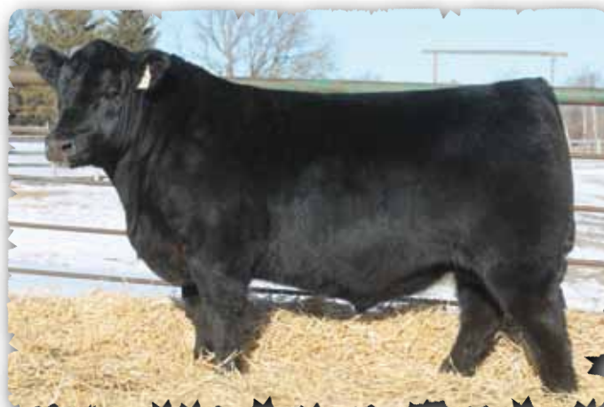
PEAK DOT FOOTHILLS 355E - LOT 79

>Recommended for heifers >A bull that excels in calving-ease and maternal value. You will want to keep all his daughters. >Grandam and great grandam are past embryo donors.