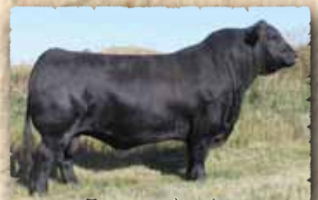
SAV Top Soil 4354