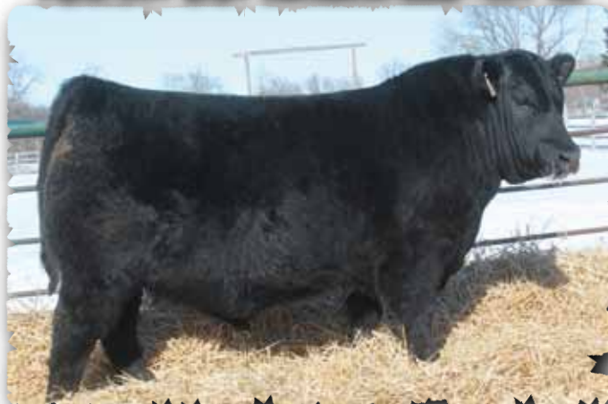
PEAK DOT EASY DECISION 309E - LOT 168