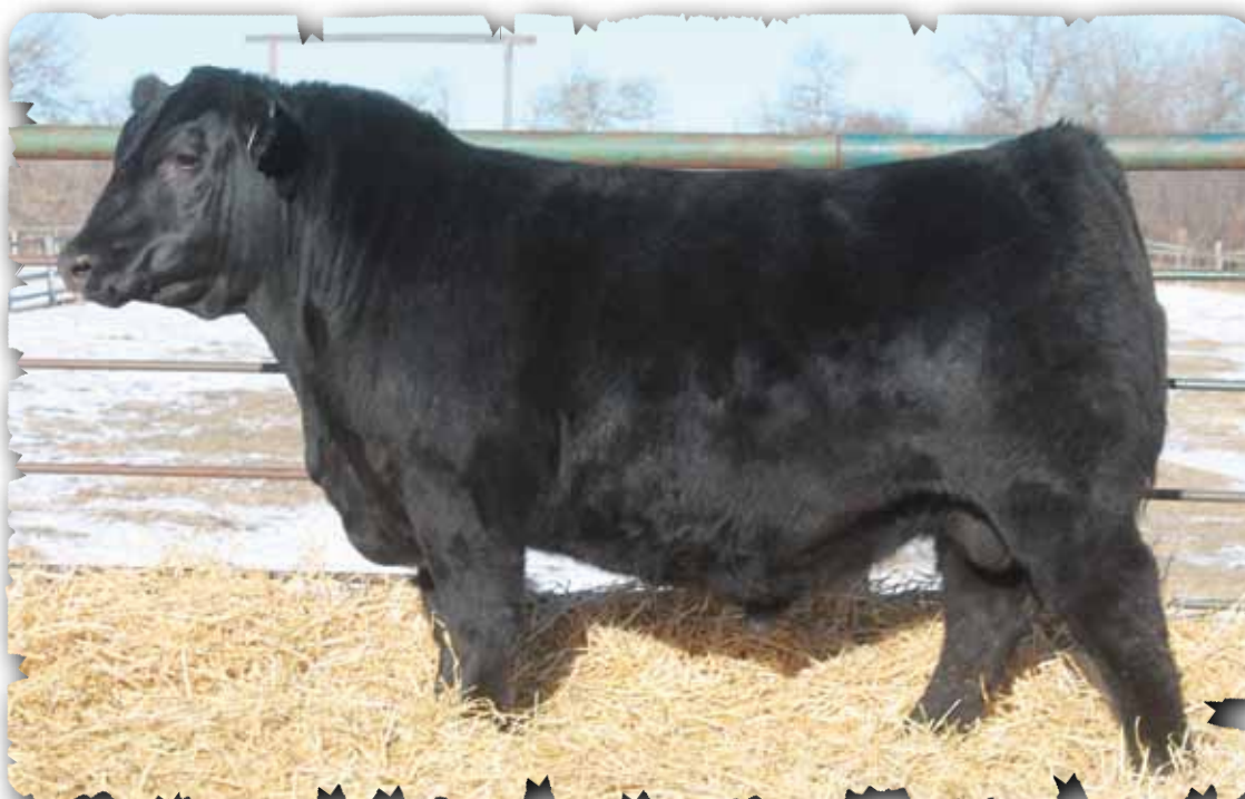
PEAK DOT COUNTRY 220E - LOT 87

Country is a deep-bodied individual that offers an abundance of width and fleshing ability. He was the top performing bull from the 2013 calf crop earning a 205 day weaning weight of 1056 lbs for a weaning ratio of 146. His Iron Mountain dam has the look. His grandam is the most popular cow on the place and her influence can be seen throughout this offering.